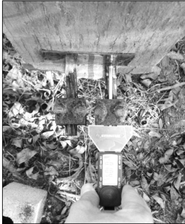
Figure 1: End Slip Measurement

The transfer length was also determined by measuring the end slip of the strands. A small sheet of Plexiglas was affixed to the ends of the beam just above the strands to ensure a uniform, flat surface against which to take measurements. Fixed blocks were then placed approximately 5-7 cm from the end of the beam before the strands were released. The exact distance from the outside of the block to the Plexiglas on the ends of the beams was measured using a micrometer, as illustrated in Figure 1.