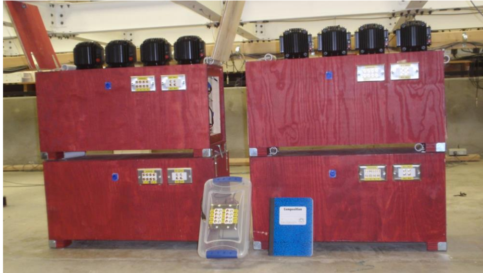
Figure 1. Components of the multi-shaker dynamic excitation system.