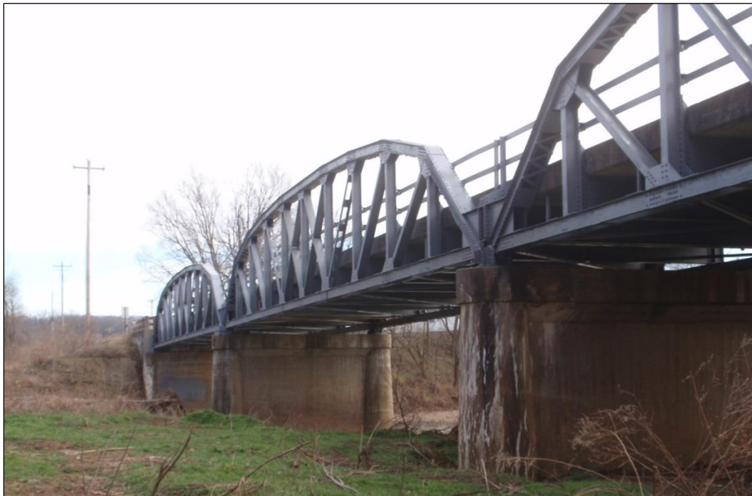
Figure 2. Photograph of the truss bridge that was tested.

One reason this particular bridge was selected for this research project was because the daily traffic usage of the bridge is very minimal. This meant that the measured vibration responses of the bridge would only be due to the natural environment or due to the multi-shaker system. The study is also benefited by the minimal traffic over the bridge because the effects of the dynamic interaction between the bridge and any vehicles could be excluded from the data analysis and interpretation. The bridge had also been dynamically tested in several earlier studies, and the modal parameters of the structure were already known with a good degree of confidence (Wank et al. 2012, Fernstrom et al. 2013a). For this particular study, only the west end span of the bridge was evaluated.