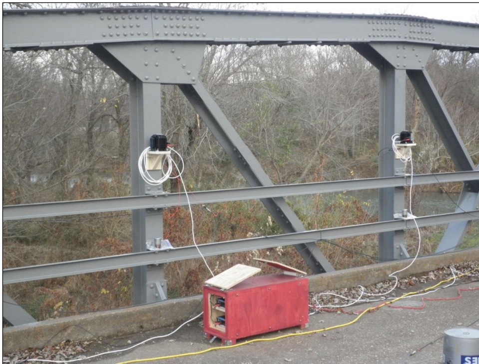
Figure 4. Experimental equipment installed on the bridge during vibration testing.