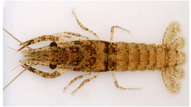
Figure 2. The Shrimp Crayfish, Faxonius lancifer , from S of Crossett, Ashley County, Arkansas.

Faxonius lancifer is readily recognized in the field by its reddish-brown to gray body coloration thickly dusted with darker specks giving it a somewhat mottled appearance, the short, narrow chelae (dactyl shorter than the length of the palm lacking longitudinal ridges and tubercles), and an acumen that is longer than the rest of the dorsum (Fig. 2). The carapace has strong cervical spines and the carapace and abdomen are about equal in length. The rostrum of F. lancifer is wide with a deep, central, trough-like depression and lateral spines and branchiostegal spines are absent. The areola is absent and the antennal scale is widest at the point anterior to mid-length. Adults rarely exceed 76 mm total length (TL) (Morehouse and Tobler 2013). The first pleopod of Form I males terminates in 2 very short processes while the mesial process is noncorneous and equal in length or slightly longer than the central projection. Pflieger (1996, Plate 14) provided line drawings of