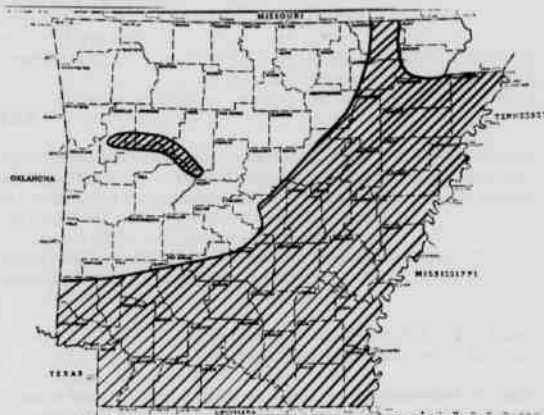
Figure 3. Proposed Range of the Nutria, Myocastor coypus , in Arkansas.