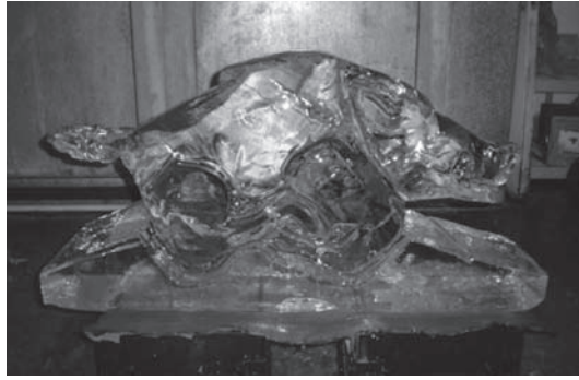
Razorback ice sculpture by HRMN student.

Students arrived at the Basin Park Hotel each Sunday and checked out each Thursday for three consecutive weeks. The class met from 8:00 a.m. until noon each day and spent the afternoon working with community leaders on critical issues such as employment and community cross-selling.