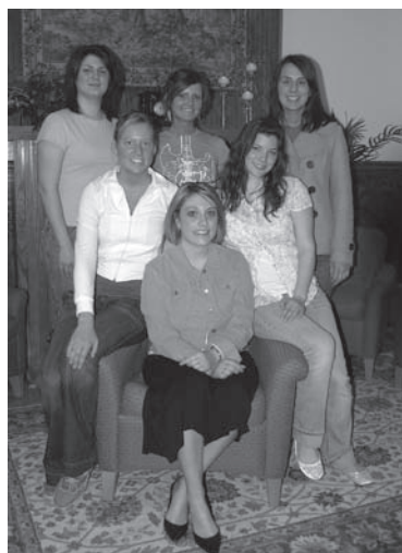
Students at the Awards and Recognition Reception.