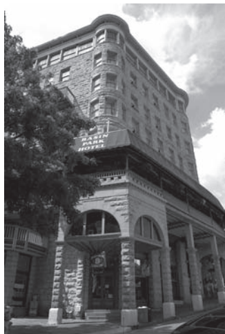
Basin Park Hotel

Basin Park Hotel, turning 100, is affiliated with the Resort Management class (HRMN) through a SEED project which is supported by the School of Human Environmental Sciences (see p. 4).