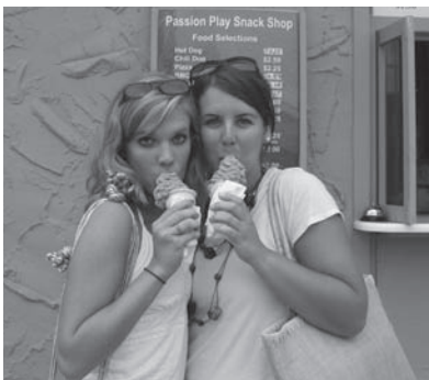
Students enjoying ice cream in Eureka Springs.