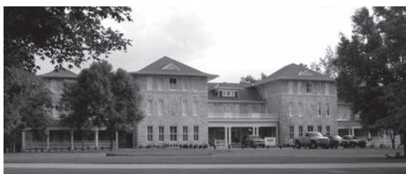
The Inn at Carnall Hall

The dinner program also included students modeling clothing from each decade of the College's history; a video presentation summarizing the history of the College; a video presentation featuring comments by alums, emeritus faculty and current and past University administrators; and music by the