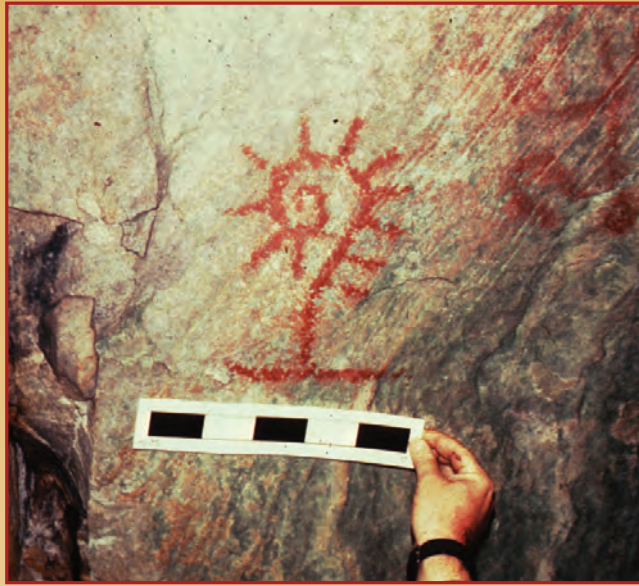
Prehistoric pictograph of a fiddlehead fern in an Ozark Mountain rock shelter.

After AD 1,000, all Arkansas Indians were dedicated to some degree to corn farming. Beans arrived from the south or west a couple of centuries later and were added to the garden, along with several varieties