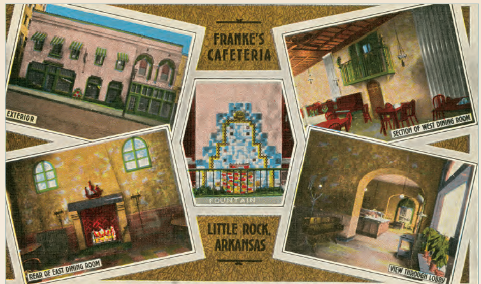
Postcard showing different exterior and interior views of Franke’s Restaurant, ca. 1930.

The love of local food surely must be a measure of home, no matter how long you’ve been away. After they married, my parents left Little Rock for St. Louis, where I was born. Growing up, I lived in Pittsburgh, Philadelphia, and Charlottesville, Virginia, with only a brief stop back in Little Rock when I was in kindergarten and first grade. No matter where we lived, we trekked home every couple of years to visit, and to eat Southern food in settings much more appropriate to the cuisine than were the kitchen tables in our various Northern houses. From my own first independent trip to Little Rock, I remember where I ate as much as anything else: the Black-