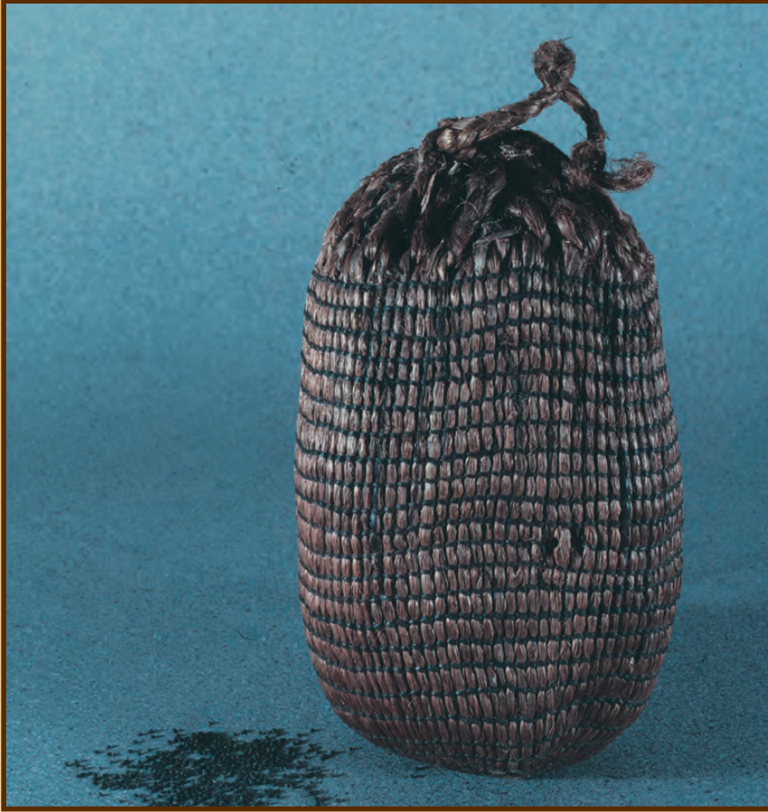
Woven bag with chenopod fruits or seeds from an Ozark rock shelter (now submerged), approximately 2,000 years old.

and shellfish were staples. Meals were roasted in fireplaces, on beds of hot rocks, or in hot ashes. Hot rock cooking in skins was likely practiced. Meat, nuts, and grains could be pounded into powder and used to thicken liquids and add flavor to the meal. Dried meat, dried grains, and fruits could be pounded into meal, and bound with grease or cooked in ashes to make cakes. Indians continued to make persimmon cakes and similar items into the historic period.