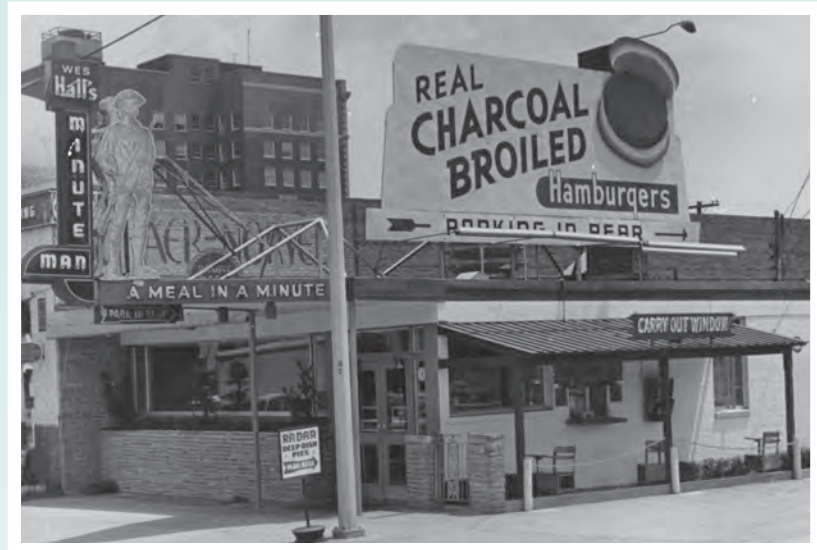
Original Minute Man restaurant at 407 Broadway in Little Rock, 1956.

I admit with some embarrassment that I had never heard of Minute Man before a researcher requested digital copies of the audiovisual materials in the Wes Hall Papers. But with my background in food anthropology, the task fell to me, and I happily accepted. The collection, housed at the UALR Center for Arkansas History and Culture, contains a wealth of correspondence, business materials, printed materials, news clippings, memorabilia, photographs, and even employee training films. And of course, audio tapes of every iteration of the Minute Man jingle.