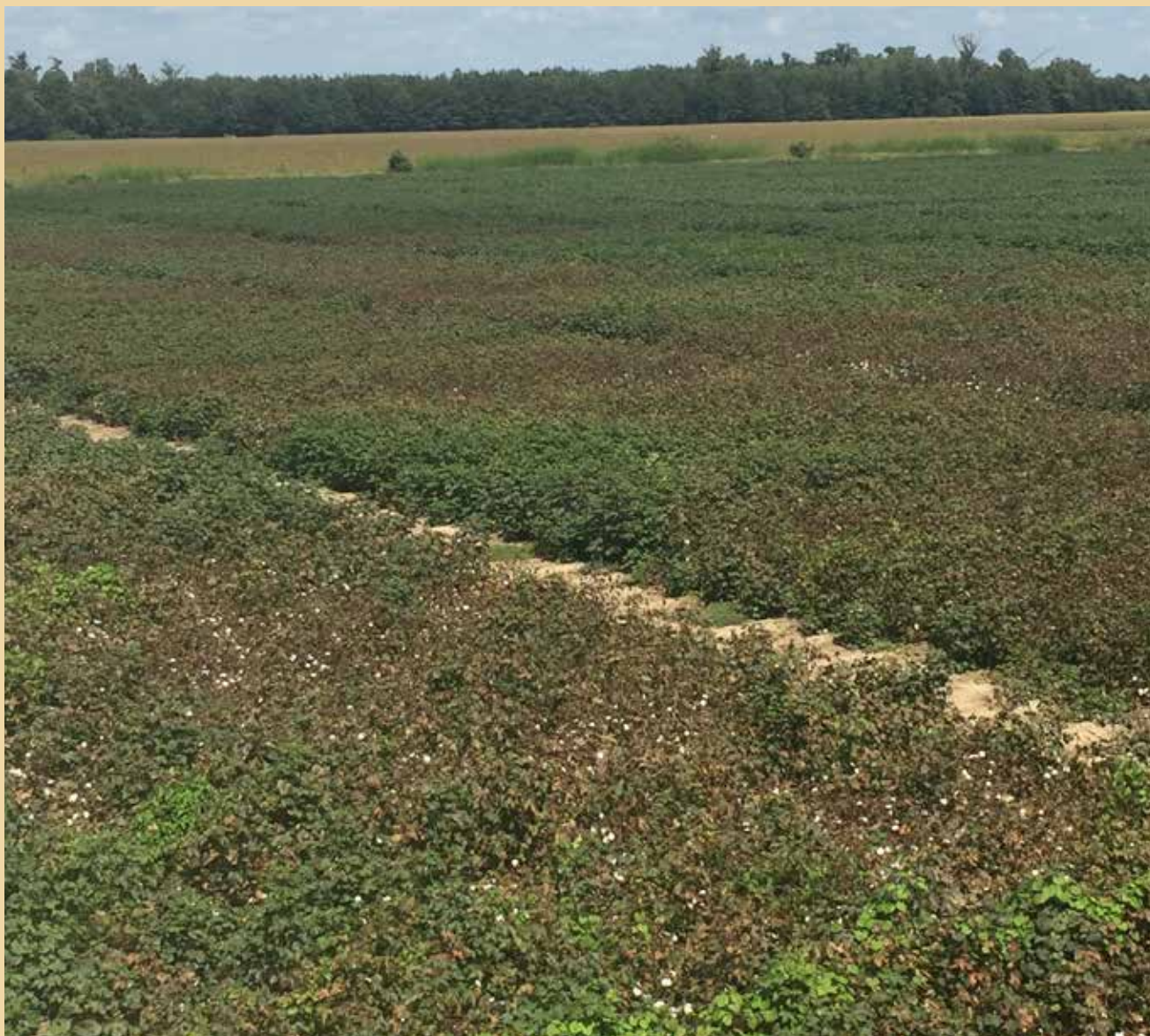
Verticillium wilt in a cotton variety test at the Judd Hill Cooperative Research Station in 2017