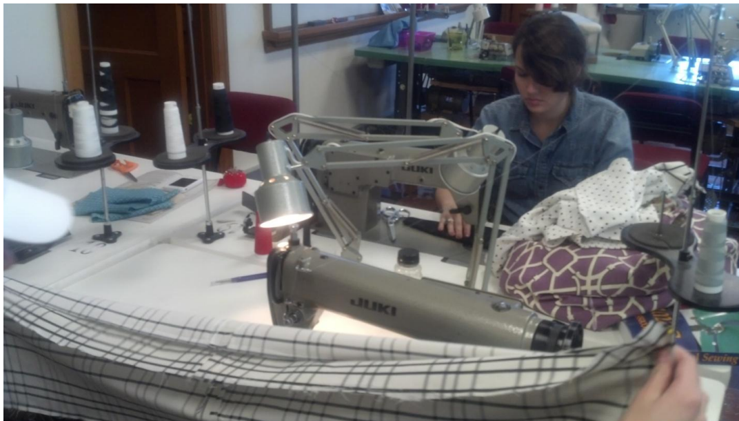
(These two students are working on infinity scarves)