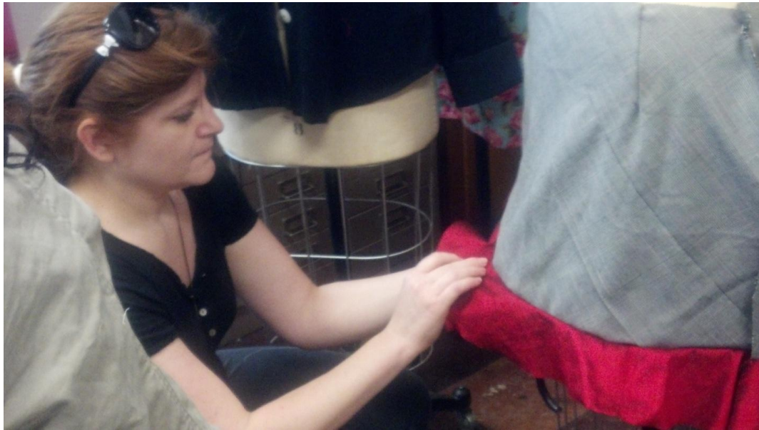
(This student is putting the finishing touches on a skirt made from disassembled business attire)

Clothing will be upcycled into new clothing or accessories including, but not limited to, skirts, vests, headbands, pillows, ties and scarves.