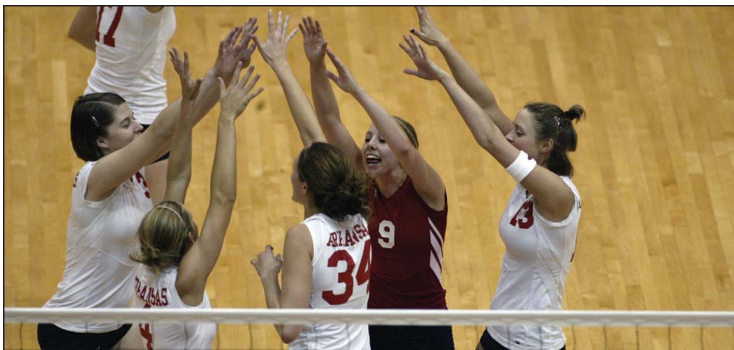
The 2004 team tallied 87 kills, the No. 10 total in program history, against Southwest Missouri State in the regular-season finale at Barnhill Arena.