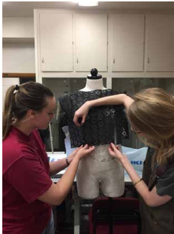
Fig. 3. The authors assemble 3-D printed top with welding glue.

A factor analysis was run to divide the 36 survey questions into groups to assist with the data analysis. The factor analysis divided the questions into three groups: prior exposure to 3-D printing, innovative fashion interest, and opinions of the aesthetics of the 3-D-printed project garment. Each factor was then tested for reliability using Cronbach's Alpha test and a total of 25 out of 36 questions were retained within the factors to ensure the strength of each group of questions. Data were entered into MS-Excel spreadsheets and divided into the three factors, and a mean score was calculated for each respondent based on their response to each item within the factors. The data were then organized based on gender, and a t -test with unequal variances was conducted to test whether there was a significant difference in responses between male and female respondents for each factor. In conducting the t -test, a P -value of 0.05 or less was used to indicate a significant difference in gender response. Additional descriptive statistics were utilized from the data means to illustrate the range in responses received from various ethnic and age groups. These demographic questions sought to understand what ethnic groups and age ranges were participating in the survey. The ethnic groups reported were American Indian (0.86%), Asian (3.45%), Black (14.66%), Hispanic