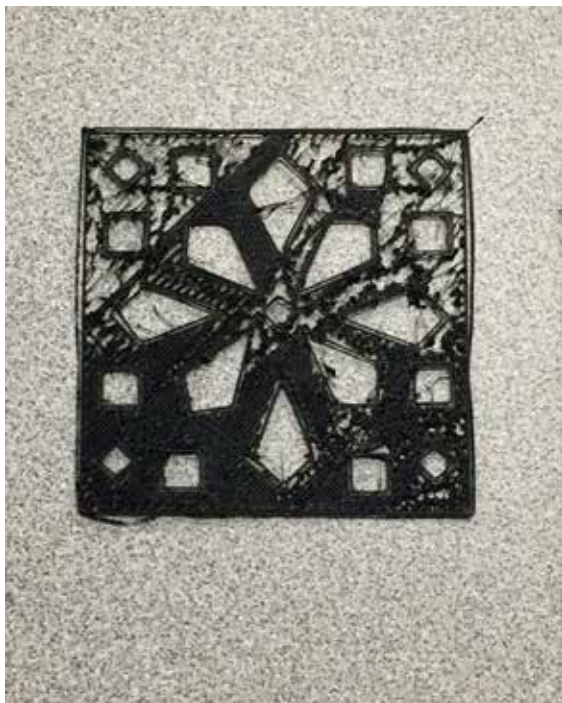
Fig. 1. Final tile designed by the authors, printed in thermoplastic polyurethane (TPU) filament.

To create a 3-D-printed textile for garment assembly, several repeatable square tiles were designed using the 3-D building freeware 123D-Design (Fig. 1). To test each tile's strength and repeatability, prototyping was conducted on the Raise 3-D N2 and N2 Plus 3-D printers, first in polylactic acid (PLA) and then in thermoplastic polyurethane (TPU). The PLA was useful for quick prototyping as a low-cost hard plastic filament, and TPU was chosen as the final print material due to its flexibility and rubber-like properties. The final tile was then repeated at a half-step pattern to create a single sheet of textile, and 13 sheets in total were printed measuring 206.375 mm long by 206.375 mm wide by 0.9 mm high (Fig. 2). These sheets were then combined using JB Weld Plastic Bonding Glue to create a full piece of 'fabric', which allowed for cutting out the flat pattern pieces (Fig. 3). The pattern pieces were then assembled into a top using the welding glue, and TPU filament was used to