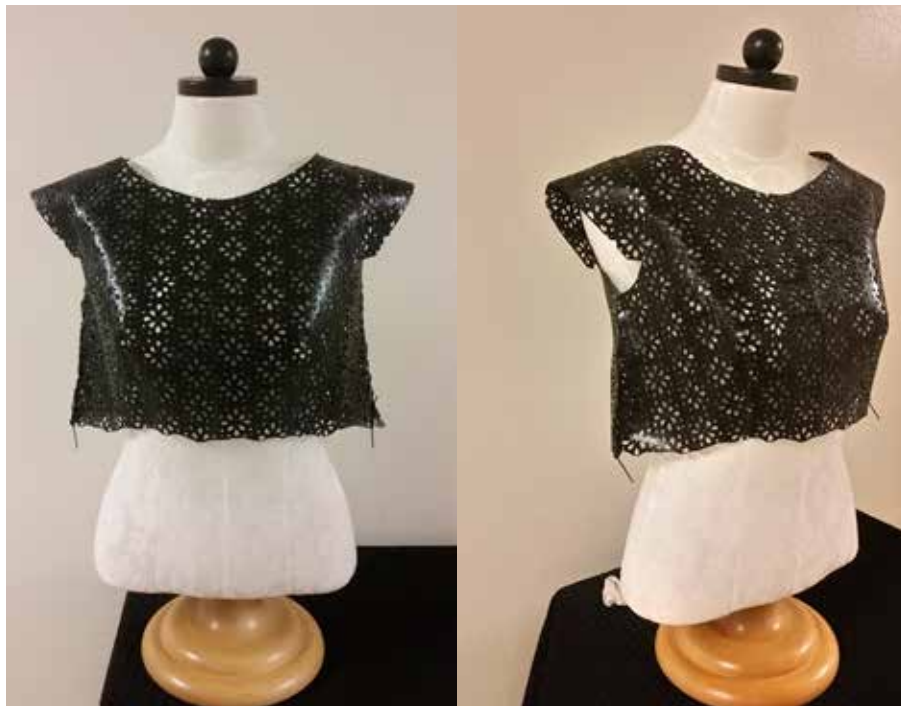
Fig. 4. Final 3-D printed top.

There are also some important considerations that the apparel industry should take in adopting 3-D technologies. For one, 3-D printing offers a sustainable solution to waste in the apparel industry by being an additive manufacturing process. Designers and manufacturers should research the abilities of 3-D printing to create a garment with zero waste; whereas this study applied subtractive manufacturing clothing production techniques in cutting out pattern pieces from a larger textile and, therefore, created waste from the scrap pieces of material. In addition, 3-D printing also offers the opportunity for a dramatically decreased lead time. Studying the effects of a condensed supply chain with minimal to no sample lead time will provide the industry more insight into how 3-D printing could affect jobs