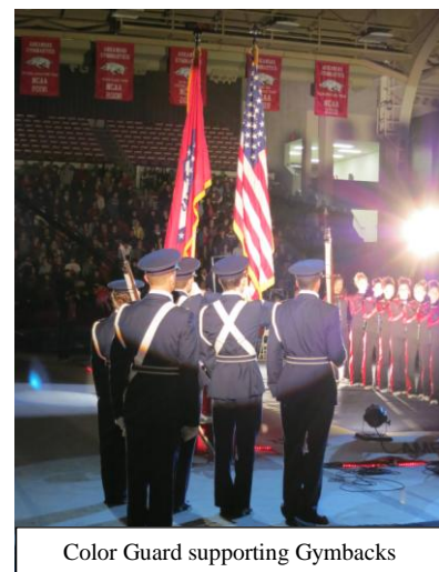
Color Guard supporting Gymnastics