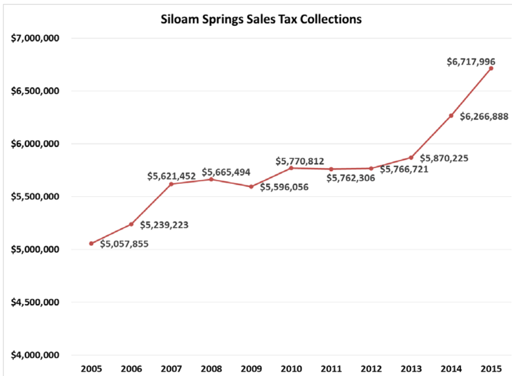
FIGURE 2: SILOAM SPRINGS SALES TAX COLLECTIONS

Spending from the visitors to the proposed whitewater and mountain biking park in Siloam Springs would provide additional sales tax revenues for the City of Siloam Springs. Current sales tax collections of two percent generated revenues of $6.72 million in 2015. On average, since 2005, sales tax revenues have grown 2.9 percent annually, although in the 2014 and 2015 the sales tax revenues grew by 6.8 percent and 7.2 percent. The chart below shows the growth in sales tax collections since 2005.