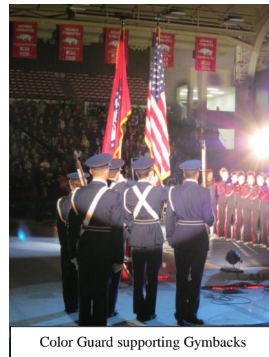
Color Guard supporting Gymnastics