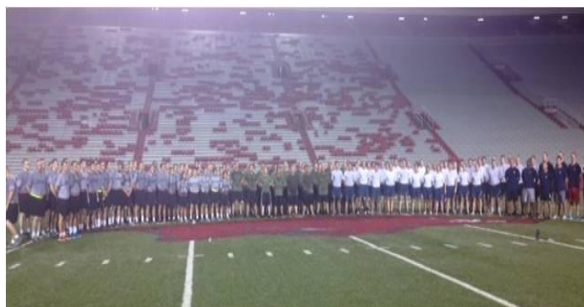
9-11 Memorial Stair Climb