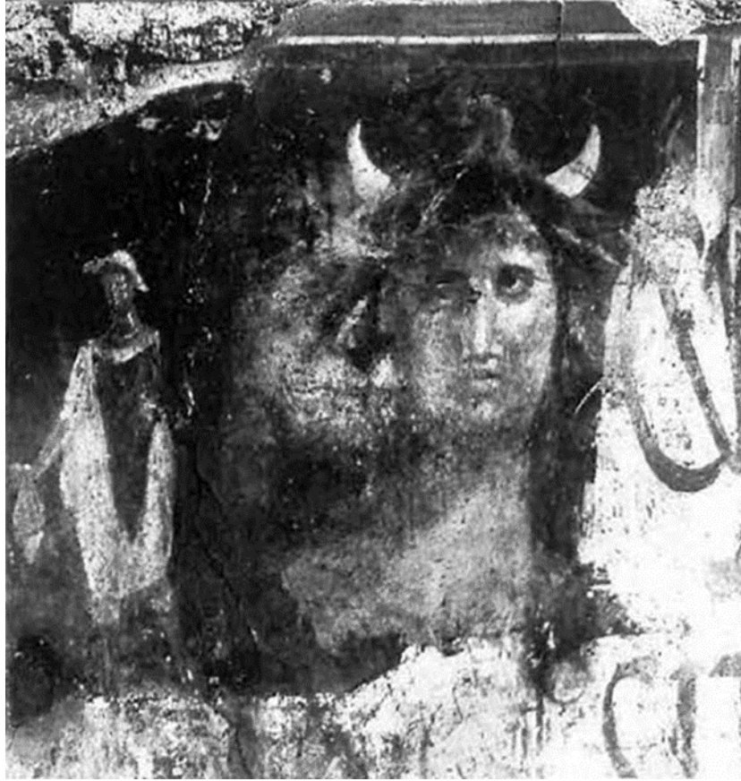
Image 4: Painting of Isis/Io outside caupona (I.12.4).