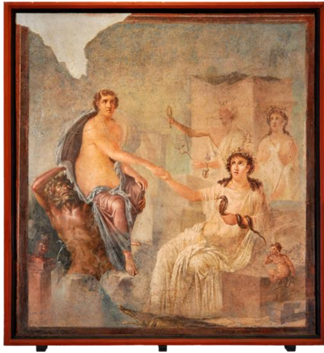
Image 2: Fresco from the Temple of Isis called Io at Canopus . Now in the Naples National Archaeological Museum.