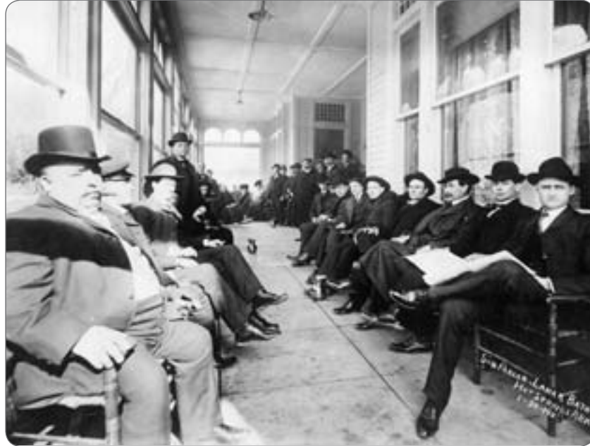
Men relaxing in the sun parlor of the Lamar Bath House in Hot Springs, January 31, 1905, Mary D. Hudgins Collection (MC 534), Box 105, Folder "Lamar Bath House," Image 1838.