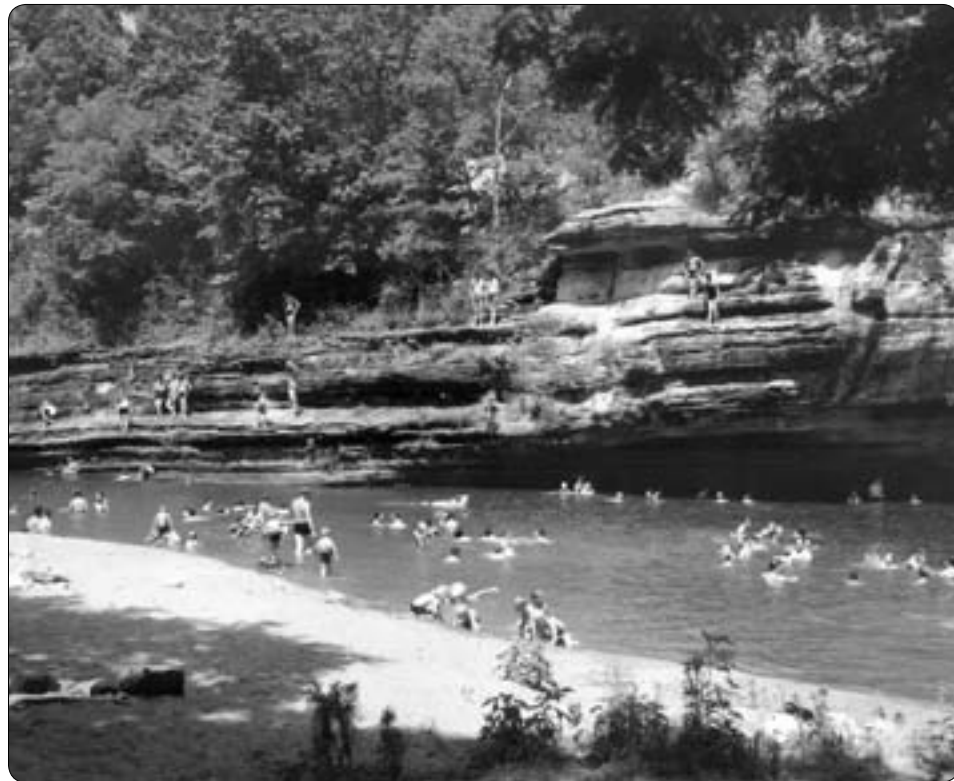
A popular swimming hole on the upper Buffalo River situated at the Highway 7 crossing near Pruitt, ca. 1965. The caption on the back reads: “Stone ledges provide natural diving platforms.”

The materials in the recent addendum have now been processed and opened for research. This manuscript collection, Ozark Society Records 1962–2001 (MC 477), encompasses 13 boxes of materials that stretch 12.5 linear feet. Research Assistant Vera Ekechukwu processed the manuscript collection, which consists of administrative files, membership records,