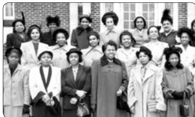
Arkansas Assistant Home Demonstration Agents for Negro Work, 1950. From the Dorris Vick Collection (MC 961), Box 2, Folder 2, Image 57.

The year 2012 marks the one hundredth anniversary of the first of what came to be known as Home Demonstration Clubs in Arkansas. In 1912, an appropriation of $1,500 from the United States Department of Agriculture General Education Board to Arkansas allowed more than 400 girls in Pulaski County to join tomato canning clubs. The “Tomato Girls” of Pulaski County laid the groundwork for 100 years of service from clubs dedicated to bettering home management and rural farm life for women and families in Arkansas.