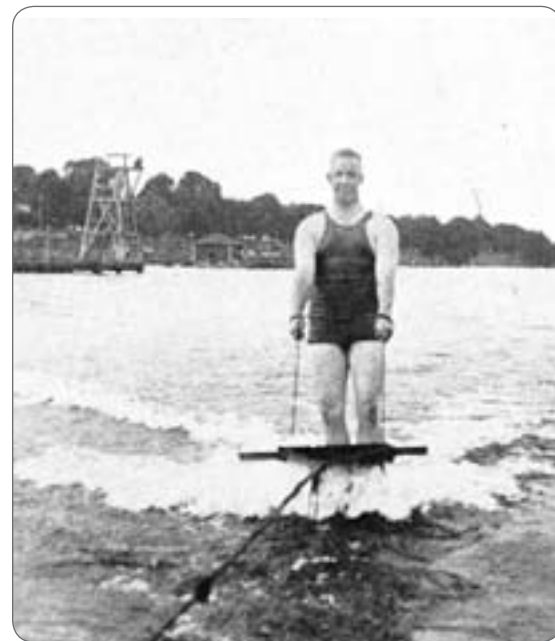
Man "surf planing" on Lake Chicot, 1926. From Arkansas Bureau of Mines, Playgrounds in Arkansas , 1926.