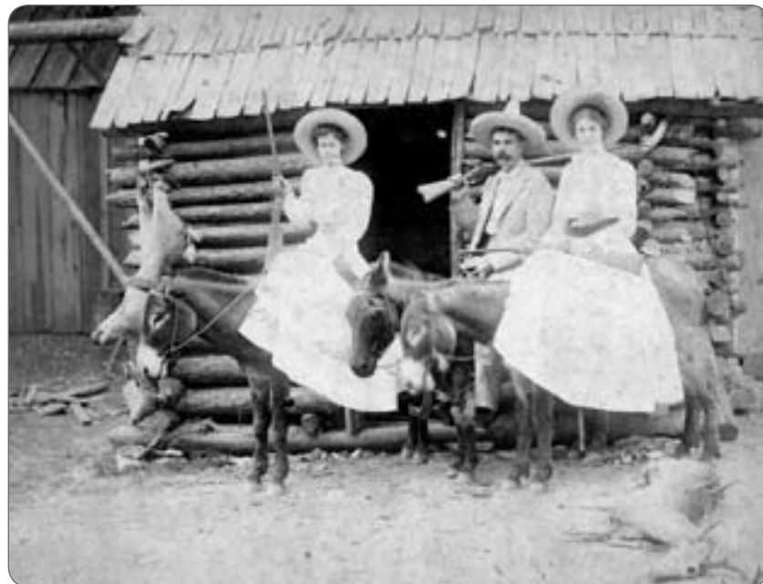
Tourists at the Happy Hollow resort in Hot Springs, July 5, 1899, Mary D. Hudgins Collection (MC 534), Box 103, Folder "Happy Hollow," Image 1218.