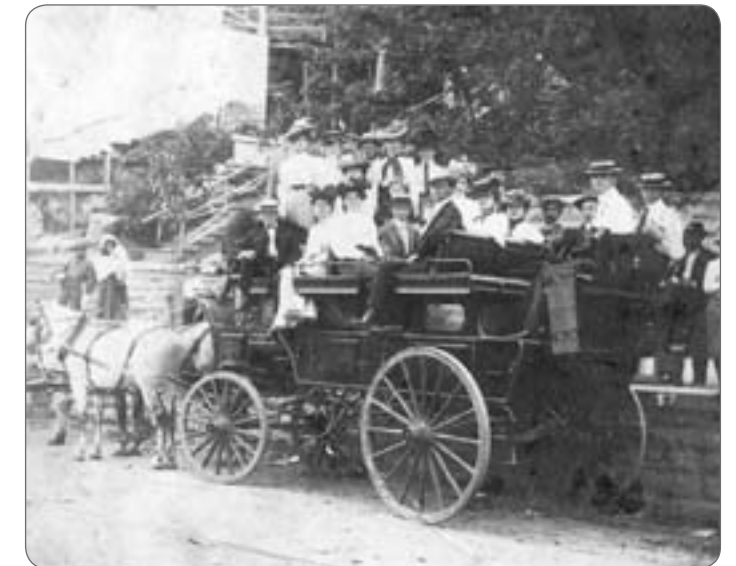
Tourists in Eureka Springs, 1890, Cora Pinkley Call Papers (MC 727), Box 14, Folder 1, Image 5.