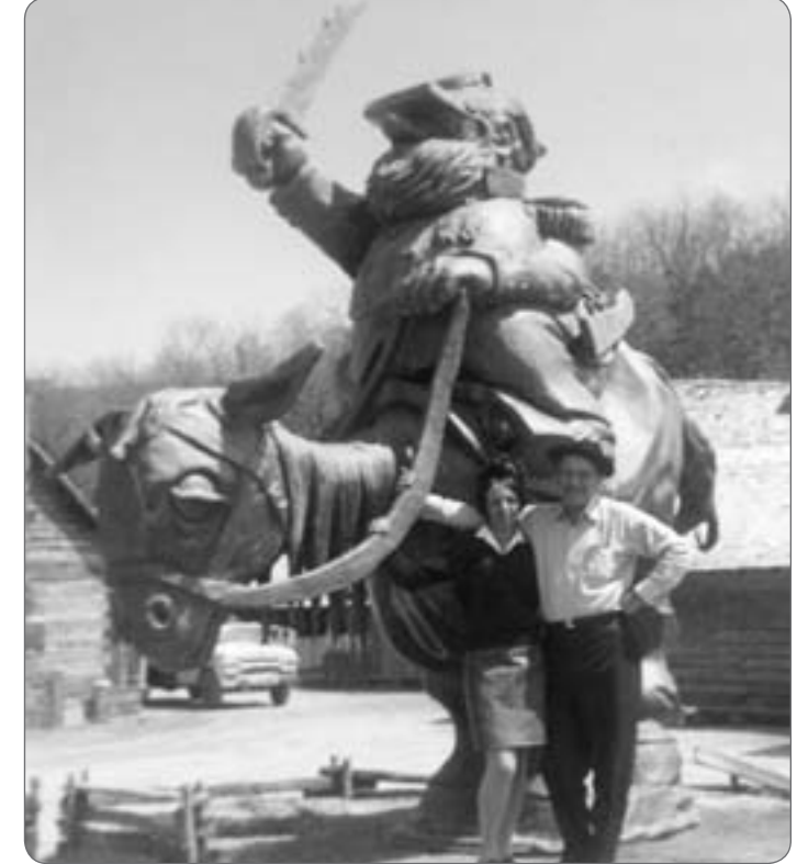
Governor Orval and Elizabeth Faubus in front of the Jubilation T. Cornpone statue at Dogpatch, U.S.A., ca. 1970, Orval Faubus Papers Addendum, (MC 922), Box 54, Folder 4, Image 1747.