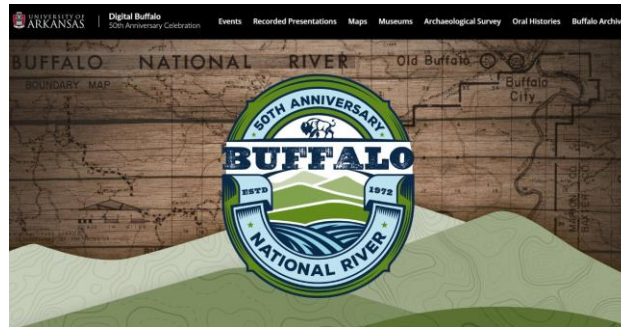
10 - The Digital Buffalo celebrates the 50th anniversary of the National Park Service's first National River.