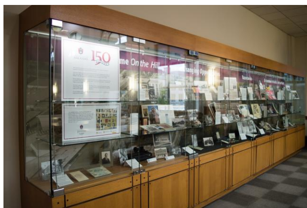
9 - Exhibit in the Walton Reading Room celebrating the U of A's 150th anniversary

The Sesquicentennial University History Working Group planned an exhibit to highlight key people, places, and events spanning the University's 150 year history. The exhibit was curated by University