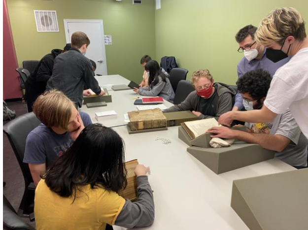
11 - Students in the Honors College Signature Seminar EUCLID explore rare books from Special Collections.