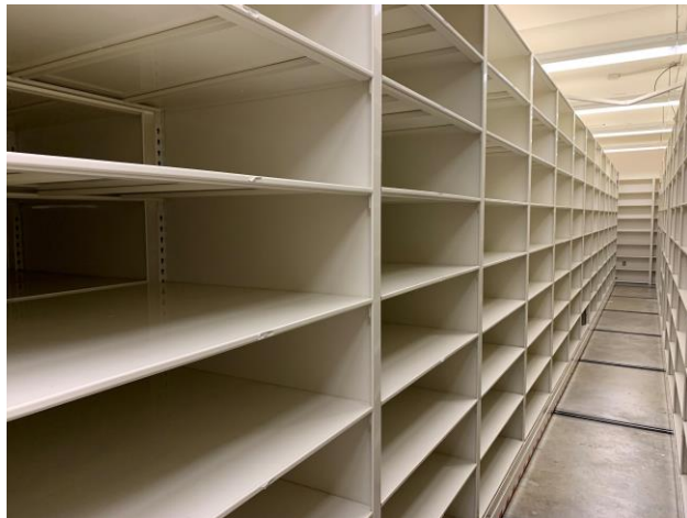
2 - During renovation: compact shelving in Special Collections after renovation prep was completed and collections moved to the Library Annex