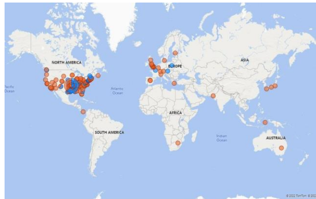
3 - Map depicting the location of researchers during FY 2021-2022.