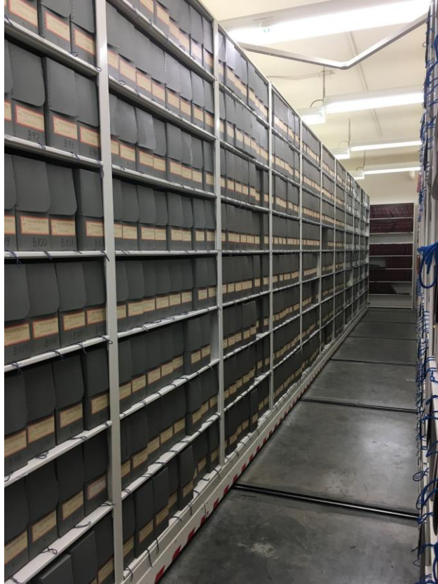
1 - Before renovation: compact shelving in Special Collections prior to renovation