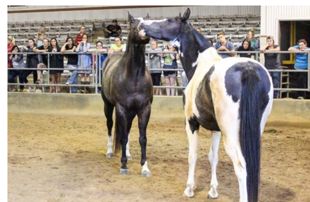
EAAT students observe the behavior of different horses during one of their first classes of the semester.

An open house hosted by the EAAT class will begin at 5:30 pm, December 8 at the Pauline Whitaker Animal Science Center. }