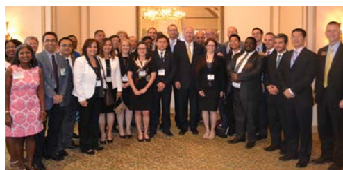
2015 FSA foreign attaché tour delegates.

time that the tour has traveled to Arkansas. }