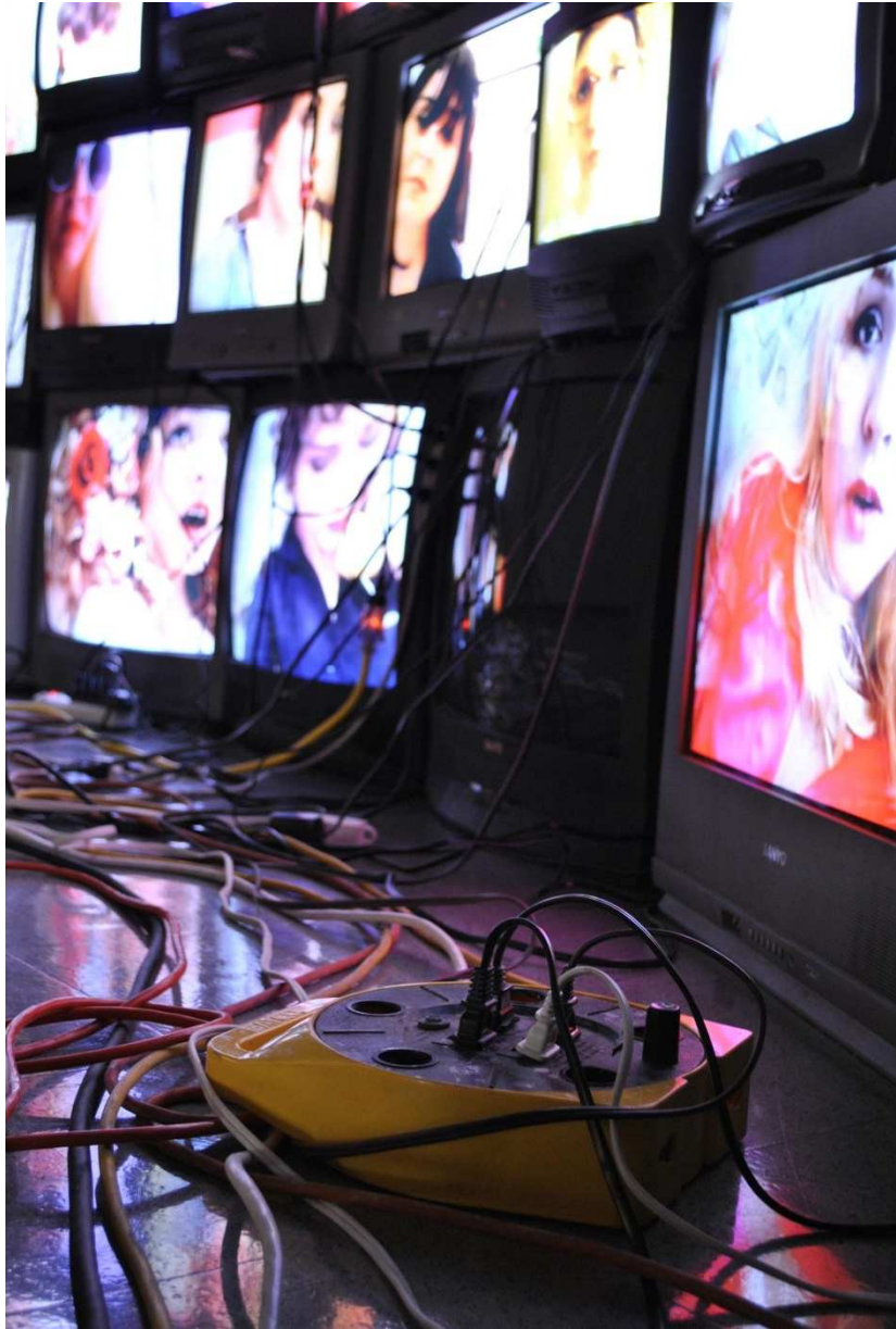
Fig. V, Cambry Pierce, The Life You've Seen: The Search for Feminine Identity Ruined My Life , 2014.