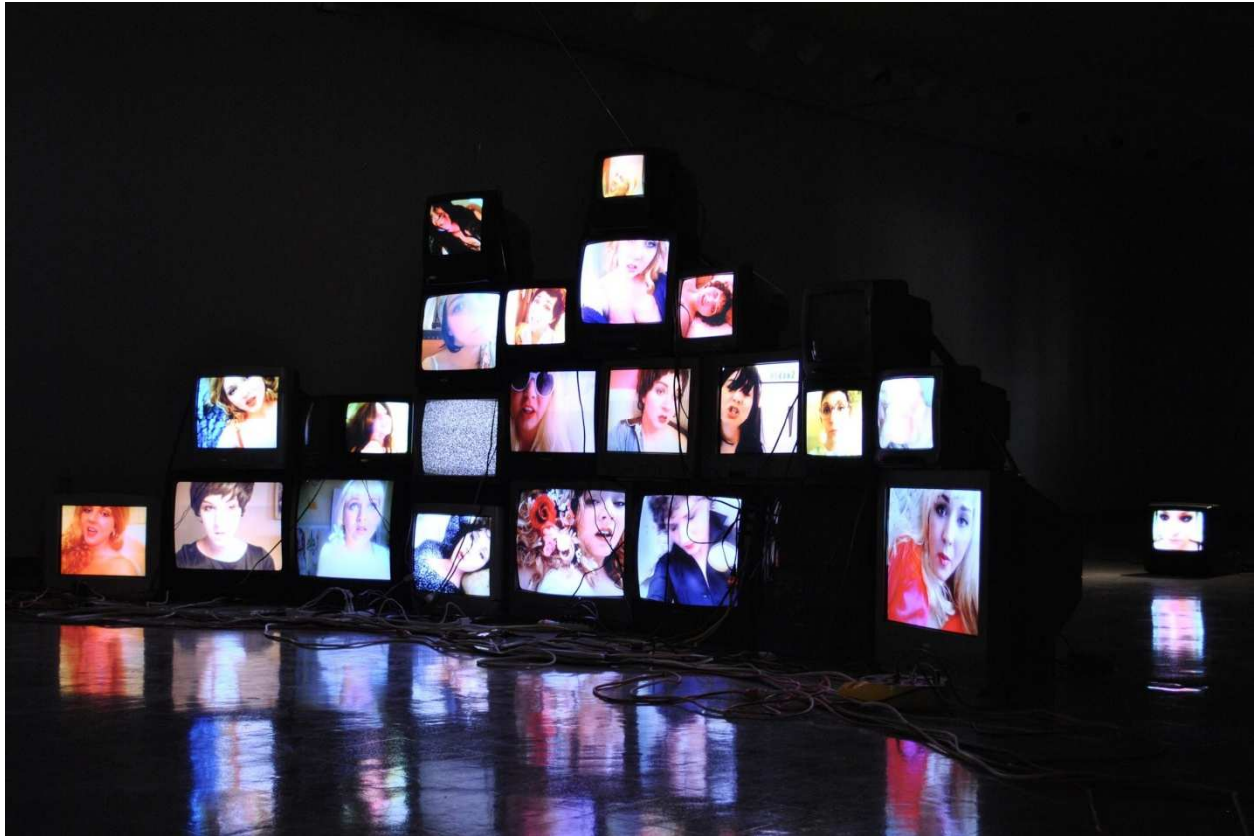
Fig. II, Cambry Pierce, The Life You've Seen: The Search for Feminine Identity Ruined My Life , 2014.