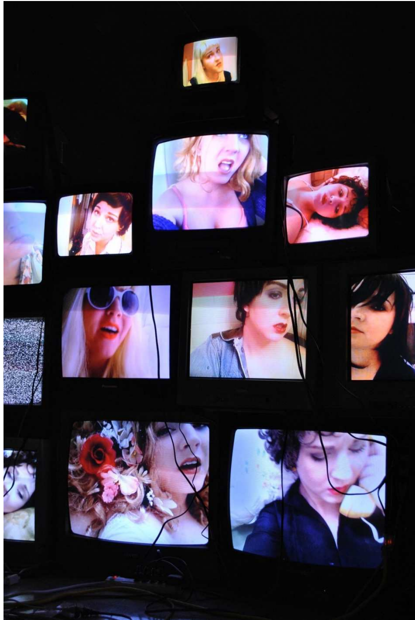
Fig. IV, Cambry Pierce, The Life You've Seen: The Search for Feminine Identity Ruined My Life , 2014.