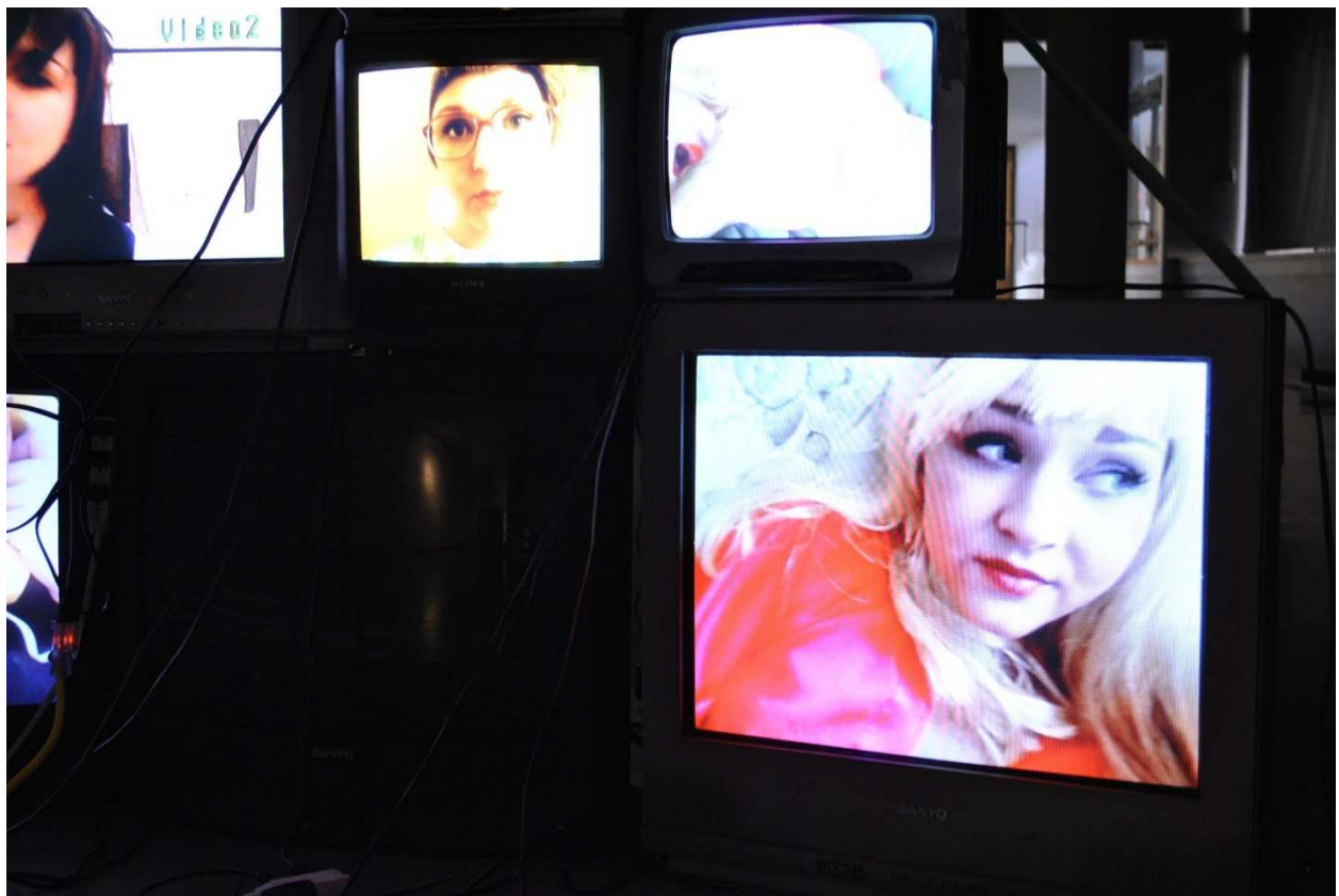
Fig. III, Cambry Pierce, The Life You've Seen: The Search for Feminine Identity Ruined My Life , 2014.