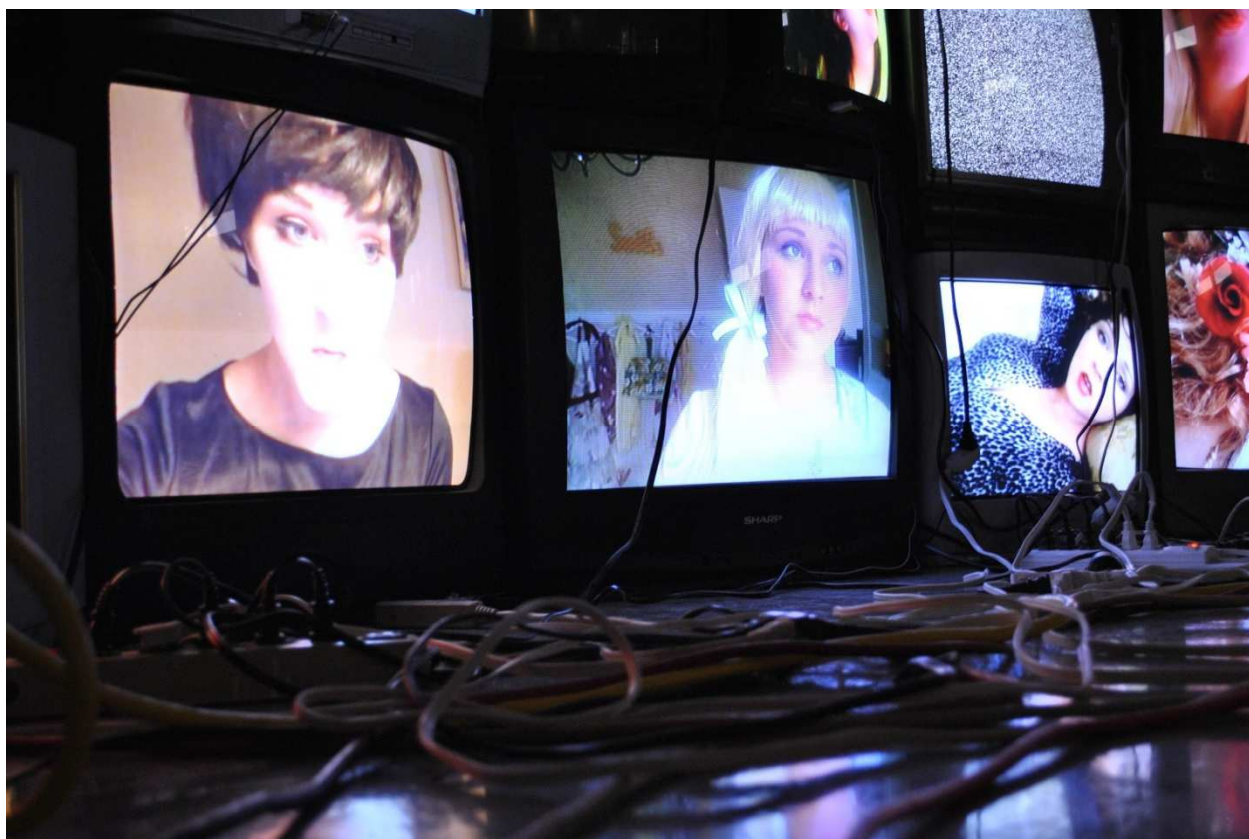
Fig. VI, Cambry Pierce, The Life You've Seen: The Search for Feminine Identity Ruined My Life , 2014.