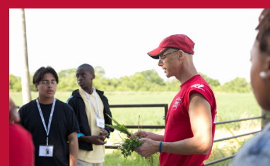
Early Access Academy