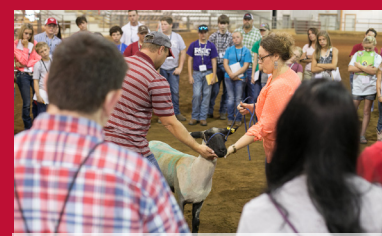
Livestock Judging Camp