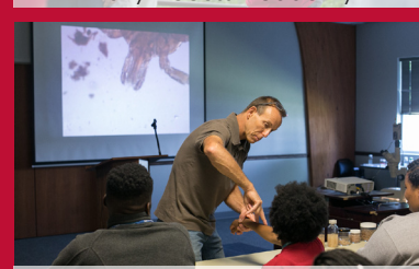
KIPP Delta Collegiate High School