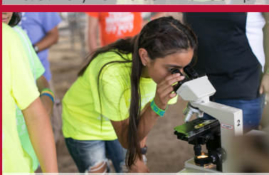
J.O. Kelly Latino Summer Camp