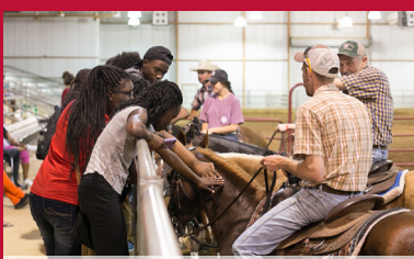
Early Access Academy

Snapshots from this summer's educational events