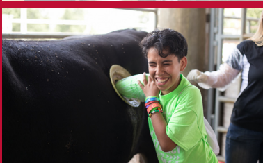
J.O. Kelly Latino Summer Camp