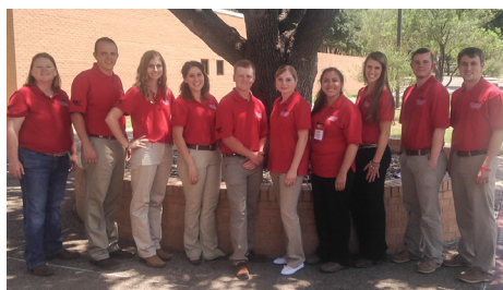
2016 AMSA Meats Quiz Bowl Team