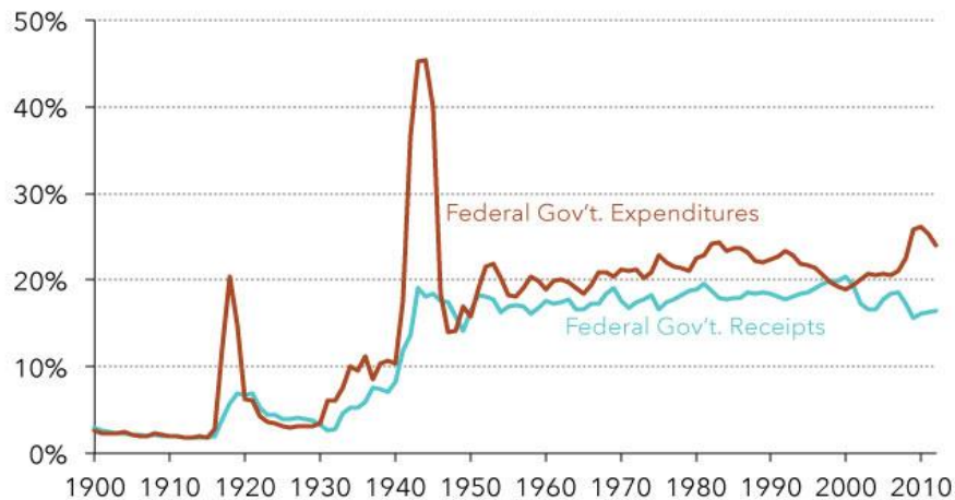
Chart 1: Federal Government Receipts and Expenditures as Percent of GDP*, 1900-2012

* Numbers are shares of GNP for 1900-1928.