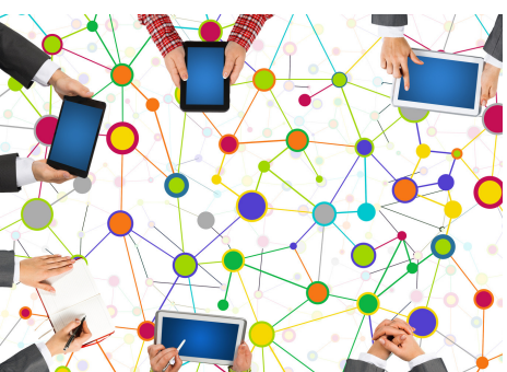
Virtual Team Projects