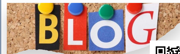
"Friday Food for Thought"

A weekly Podcast about organizational change and helping individuals and organizations experience life to the fullest, and engaging in positive, transformational change. Each episode I engage in conversations with a guest from diverse backgrounds around the topic of change.