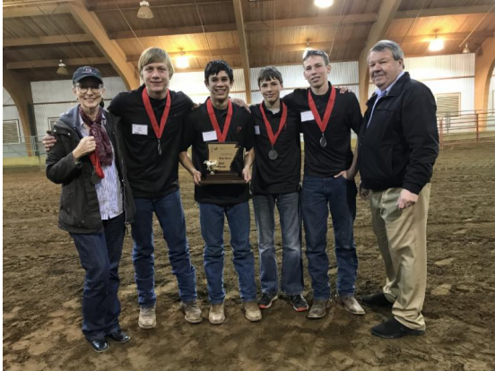
Second place "Bull Pen" team.

cattle. This program has a great impact on educating students and encouraging a broadened perspective about their role in beef production, food safety and consumer acceptance. These efforts will be continued through the University of Arkansas Animal Science, Cooperative Extension Service, Arkansas Beef Council and agriculture teachers across the state. Congratulations to the Washington County 4-H "Beef Masters" (pictured) for winning 1 st , and to the Washington County 4-H "The Bull Pen" who won 2 nd place. Salem FFA from Fulton County took home the 3 rd place trophy. }