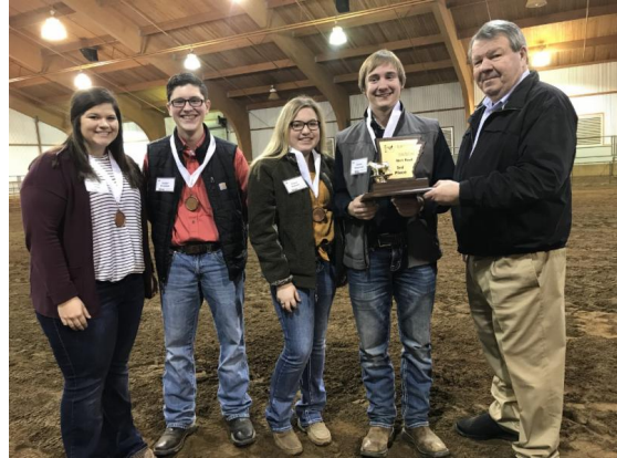
Third place Fulton County team.