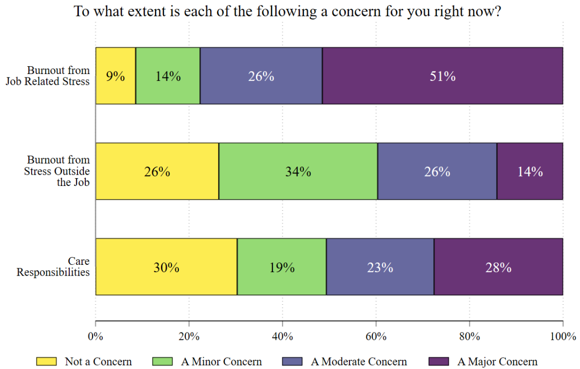
Figure 1: Teachers Levels of Concern About Burnout from Job Related Stress, Burnout from Stress Outside the Job, and Care Responsibilities