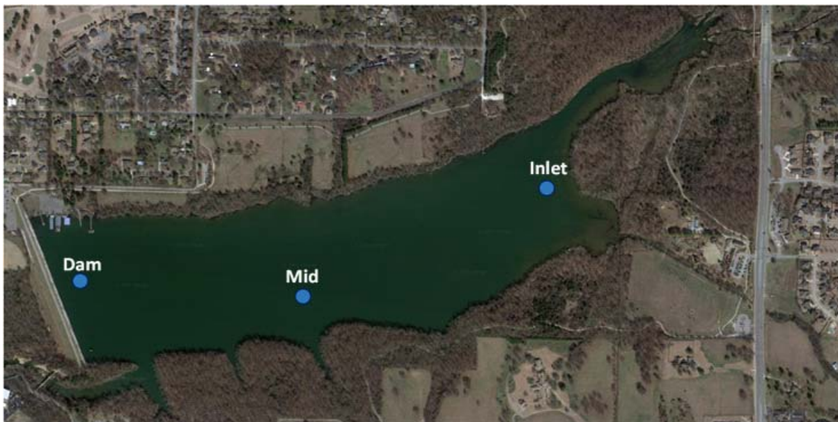
Figure 1. Sediment coring sites at Lake Fayetteville, July 2020

Upon return to the AWRC water quality lab, the depth of the water and sediments (if needed) were adjusted so that each core had one L of overlying water. Six cores per site (18 total) were wrapped to exclude light and incubated at room temperature ( \sim 22^\circ\text{C} ). The overlying water of each core was bubbled with air for 24 h, then half the cores per site were continued to be bubbled with air (aerobic conditions) while the other half were bubbled with \text{N}_2 (anaerobic conditions). The cores were incubated for a month (from July 22, 2020 to August 24, 2020), and alum was added to each core at 23 d into the incubation.