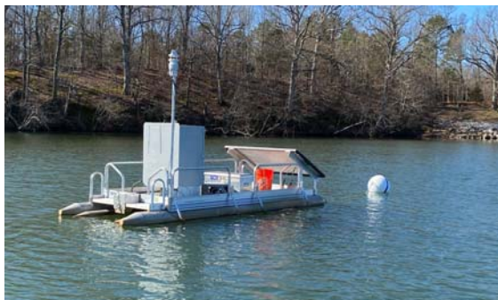
Figure 4: Research platform on Lake Fayetteville for frequent measurements of water temperature and dissolved oxygen with depth.

Algal growth at Lake Fayetteville is fueled by both N and P, and it is likely that both of these nutrients influence HABs and the production of cyanotoxins like microcystin (Wagner et al., 2020). If sediment SRP release is sustaining these nuisance and potentially HABs, then there are management options to reduce SRP release from bottom sediments in lakes. For example, alum and other Al products have been used to remediate internal P sources from bottom sediments for many decades (Welch and Cooke, 1995; Welch and Schriever, 1994). The addition of alum to lake waters results in the dissolution and disassociation of the Al salt, forming Al flocs which adsorb SRP from the water and settle to the bottom coating the bottom sediments like an Al floc blanket. Based on our core experiments and the observed decrease in SRP in overlying waters under both aerobic and anaerobic conditions, alum would be a potential management option for Lake Fayetteville. A conservative 10:1 ratio of Al to P was selected for this study, which translates to an average of 16 g Al m -2 , and it successfully reduced SRP concentration and fluxes in Lake Fayetteville cores. Alum doses have ranged between 2:1 and 100:1 ratios of aluminum (Al) to P by mass and 6