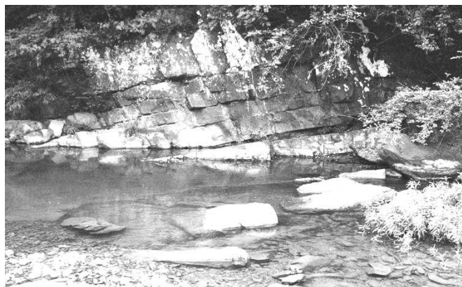
Figure 2. Collection site (Big Hill Creek) of O. acares in Hot Spring County (see Table 1). on 10 September 2009.