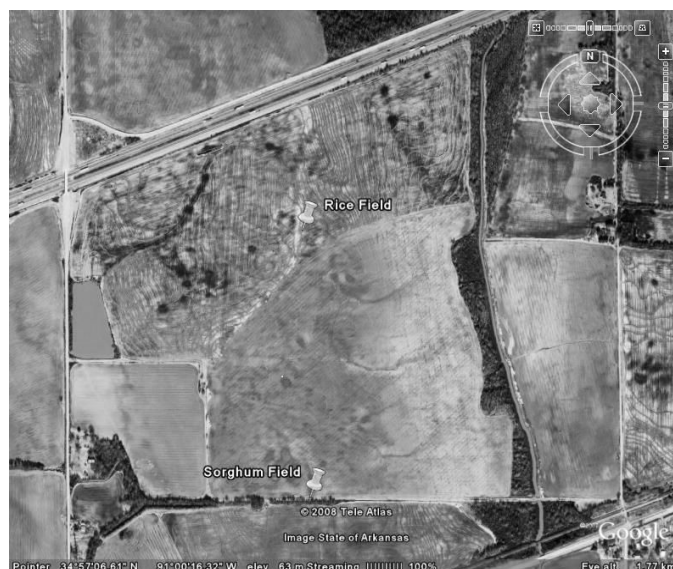
Figure 2. The two agriculture fields in St. Francis County, Arkansas (Google Earth).

Samples were taken for plankton and sediment for identification of algal and cyanobacteria species. Plankton was collected using a Fieldmaster Mini Net 80 µm mesh from the water column and surface. Sediment was scrapped from the top 1 cm of the benthic region. The samples were collected in a sterile Whirl-pak® bag and placed in a cooler on ice (0°C) until they were stored in the laboratory freezer. In the laboratory, algae were preserved with M3 (American Public Health Association 1992).