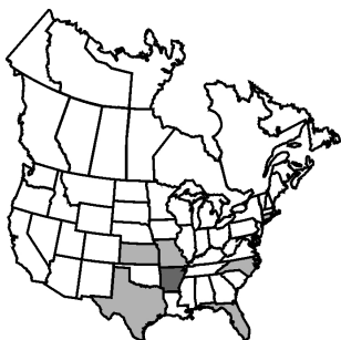
Figure 1. Arkansas collection site for Ischnodemus slossonae .

Arkansas Connecticut Florida Kansas Missouri North Carolina Texas