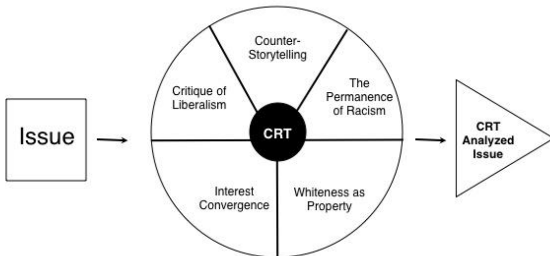
Figure 1. Critical race theory. This is a diagram created by the researcher that shows how a issue goals within the 5 tents of CRT and comes out as a analyzed isse.

CRT challenges the status quo (see Figure 1, the tenets). “As a form of oppositional scholarship, CRT challenges the experience of whites as the normative standard and grounds its conceptual framework in the distinctive experiences of people of color” (Taylor, 1998, p. 122). The introverted way to understand what oppression looks like, and how it feels to be oppressed, is to listen to the stories of those facing the experience (Wise, 2009).