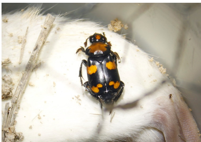
Figure 1. Deceased American Burying Beetle male on rat carrion in a bucket trap in Clark County, AR.

having only one individual to work with so we decided to run a test study with the closely related Nearctic burying beetle, Nicrophorus orbicollis . This study demonstrated that DNA extraction was best achieved using the material near the joints of the legs of the beetle. Our DNA barcoding effort was designed based upon the results of that study (Kelly and Jackson, unpub).