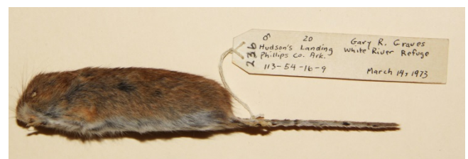
Figure 1. Southernmost specimen (UALR 236) of Reithrodontomys megalotis collected in the Mississippi Valley, obtained at Hudson Landing, Phillips County, Arkansas, on 14 March 1973.

The southernmost specimen from Arkansas (Fig. 1) was collected in Phillips County at Hudson Landing (34° 11.29' N; 91° 4.26' W) on the White River levee, about 200 m south of the pumping station on 14 March 1973 (UALR 236; ♂; collected by Gary R. Graves, catalog number 20), as compared to McDaniel et al. (1978). This location lies 77 km southeast of the nearest collection site in Lee County. The trap was set in a Hispid Cotton Rat ( Sigmodon hispidus ) runway in a dense stand of grass and forbs at the edge of a blackberry ( Rubus sp.) thicket at the base of the levee.