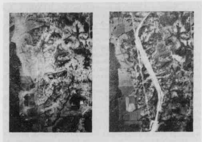
Figure 2. Aerial photos of Saratoga Landing Blackland Prairie area in 1951 (left) and 1964 (right). The area was substantially prairie (grazed) in 1951 and substantially forested in 1964. A powerline and a railroad were built between photographs. Cleared fields to the left are now in Millwood Lake. North is up in both photographs.

In 1939, when the first aerial photographs of the area were taken, the area was still primarily open prairie, with scattered trees over much of the area, and dense forest in parts, primarily along streams. The 1951 aerial photo of the area shows much the same pattern; however, the 1964 photo shows far more forest land than previously (Fig. 2). A