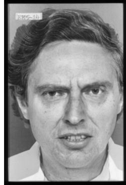
Male (70% Anger)

What emotion is being depicted? Angry / Happy / Sad / Disgust / No Emotion