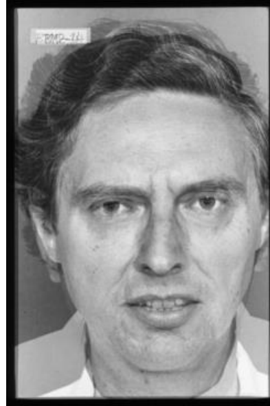
Male (50% Anger)