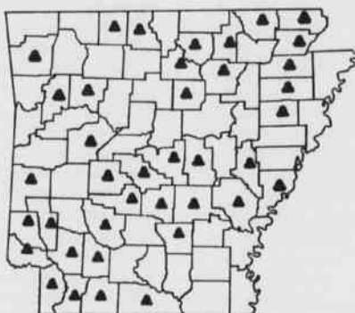
Figure 2. Laccophilus fasciatus rufus