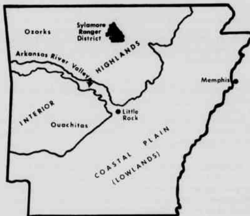
Figure 1. Map of Arkansas indicating location of Sylamore Ranger District, Ozark National Forest, and general physiographic regions which appear to influence distribution of amphibians and reptiles in the state (modified from Dowling, 1957).

A few preliminary collecting trips were conducted in May 1969. Daily collections were begun 8 June 1969 and continued through 15 August 1969. Subsequent weekend trips were made during the following 33 months. The number of trips varied