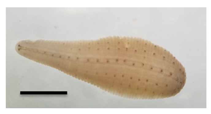
Figure 3. Helobdella europaea (YPM IZ 101859). Scale bar = 2 mm