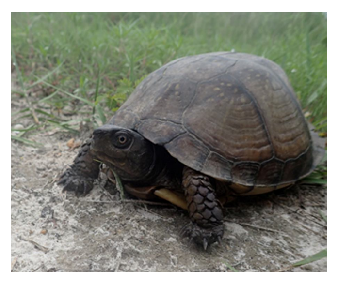
Figure 1. Gulf Coast box turtle, Terrapene carolina major.

Leeches collected were prepared as described by Moser et al. (2006). Specimens were subjected to molecular analysis according to Richardson et al. (2010) as follows: Purified PCR products were sequenced using the HCO2198 primer and the LCO1490 primer (Light and Siddall 1999) for the Cytochrome c oxidase subunit I products by the W.M. Keck Foundation Biotechnology Resource Laboratory at Yale University. Aligned DNA sequences were compared to other leech DNA sequences contained within Genbank and in the authors' databases to confirm identifications and deposited in GenBank. Specimens of leeches were deposited in the Peabody Museum of Natural History at Yale University, New Haven, Connecticut (YPM IZ).