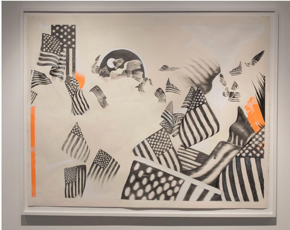
Figure 3: Michael Pennekamp, Forty Flags , 55.5"x 44.5", Graphite, Acrylic Paint, Latex Paint, Silkscreen, Chine Collé on paper, 2017