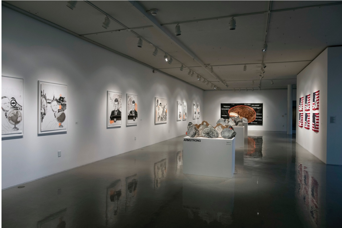
Figure 1: Michael Pennekamp, To the Moon and Back (Gallery View), 2017.