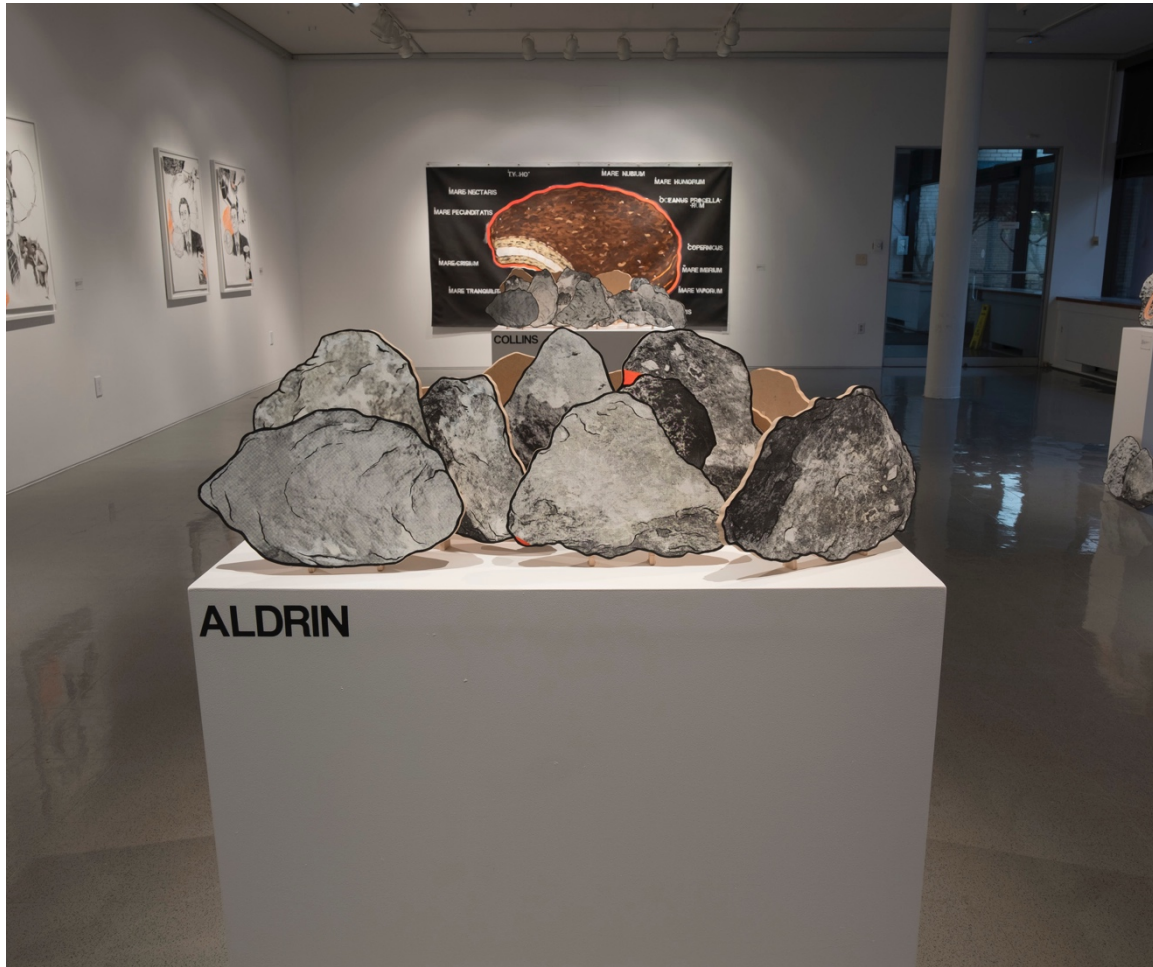
Figure 5: Michael Pennekamp, Lunar Samples (Aldrin) , Dimensions Variable, Silkscreen, Acrylic Paint, India Ink, Graphite, Phosphorescent Paint on MDF, 2017