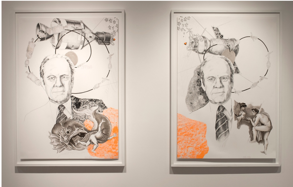
Figure 11: Michael Pennekamp, Chapter 3: Gerald Ford or Devine Intervention and Apollo-Soyuz , 28" x 40.5" (each), Graphite, Editing Pencil, Acrylic Paint, India Ink, Vinyl Letters, Silkscreen, Chine Collé on paper, 2017