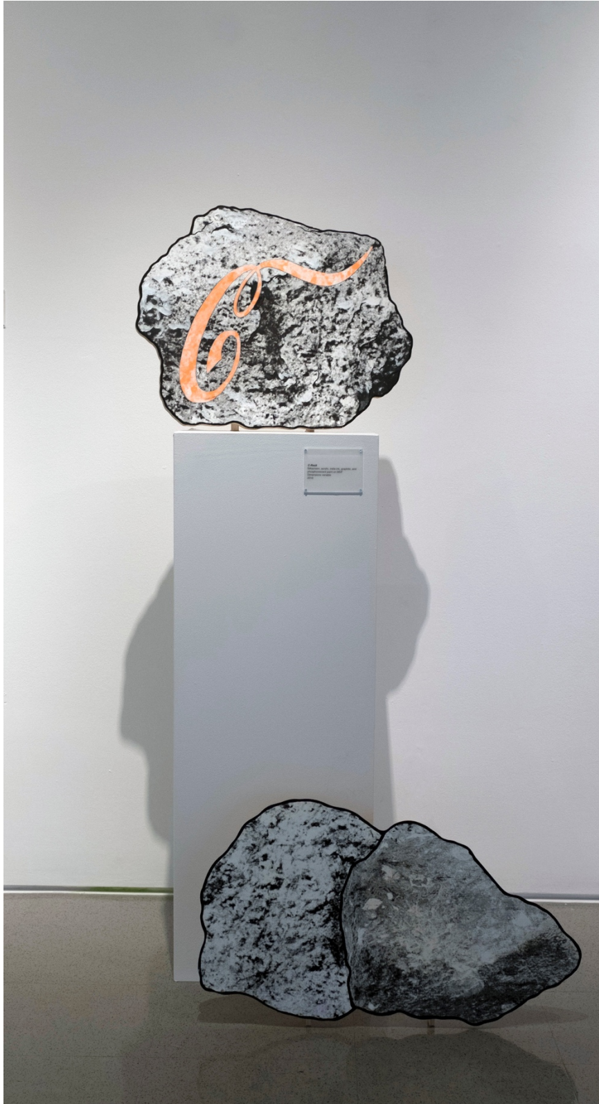
Figure 7: Michael Pennekamp, Lunar Samples (C-Rock) , Dimensions Variable, Silkscreen, Acrylic Paint, India Ink, Graphite, Phosphorescent Paint, Chine Collé on MDF, 2017