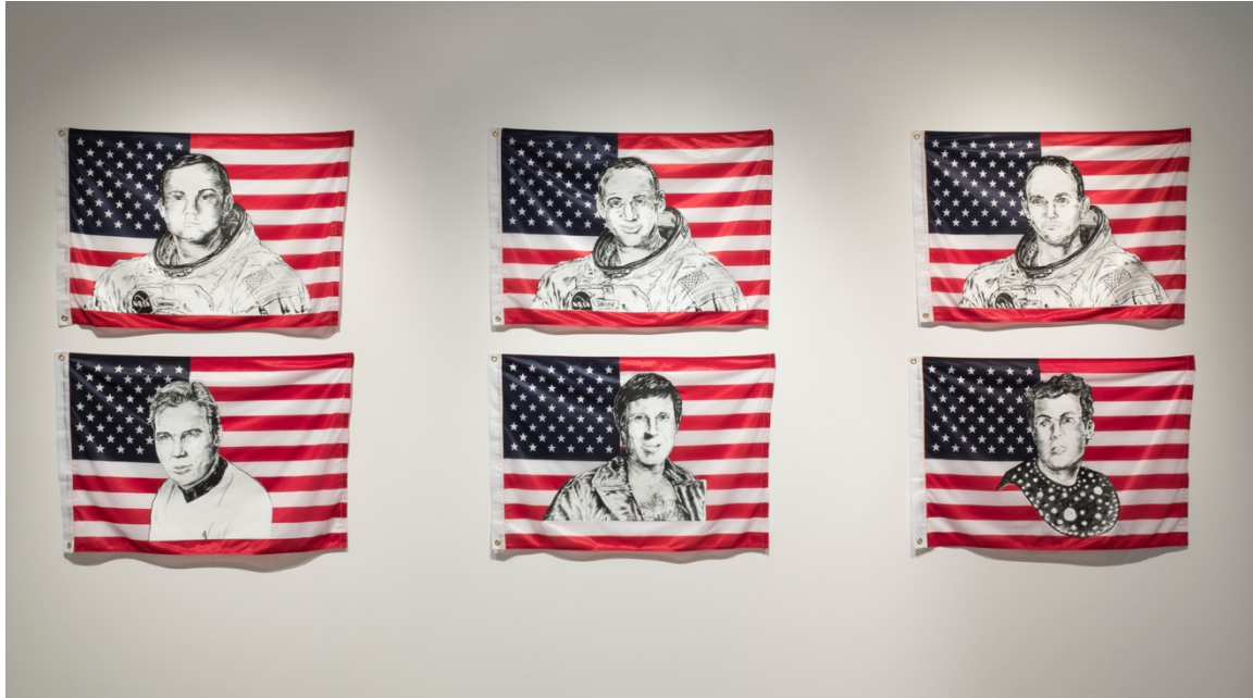
Figure 2: Mike Pennkamp, American Icons , Acrylic, Silkscreen, Graphite, Imported American Flags, 2017