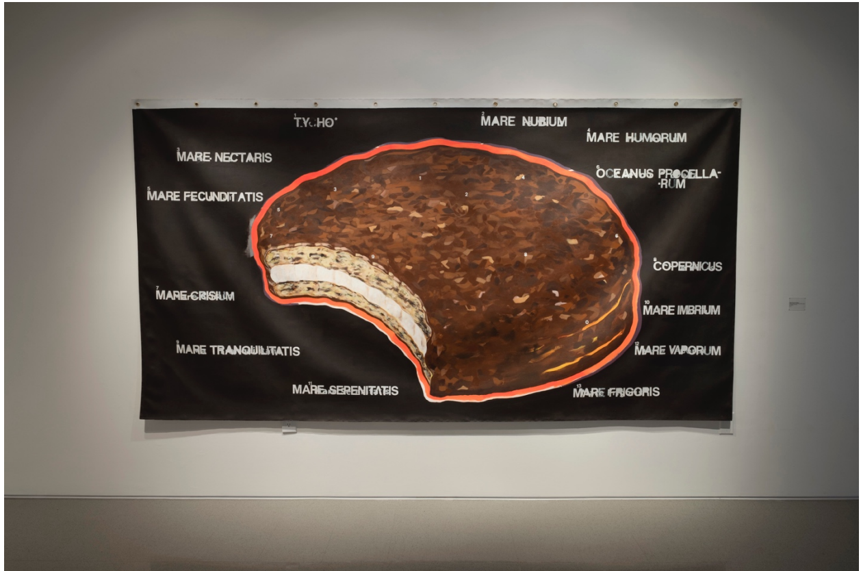
Figure 8: Michael Pennekamp, Moon Pie (Lunar Surface) , 132" x 71", Acrylic Paint, Vinyl Letters, Graphite, Phosphorescent Paint on unstretched canvas, 2017