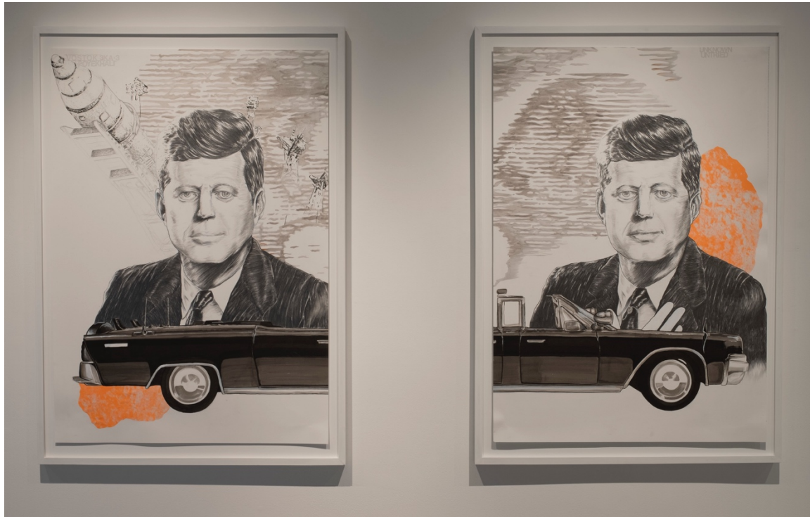
Figure 10: Michael Pennekamp, Chapter 2: John F. Kennedy or St. Jude, Patron Saint of Lost Causes , 28" x 40.5" (each), Graphite, Editing Pencil, Acrylic Paint, India Ink, Vinyl Letters, Silkscreen, Chine Collé on paper, 2017