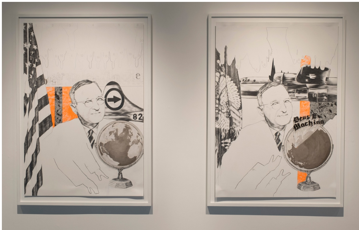
Figure 9: Michael Pennekamp, Chapter 1: Harry Truman or God in the Machine , 28" x 40.5" (each), Graphite, Editing Pencil, Acrylic Paint, India Ink, Vinyl Letters, Silkscreen, Chine Collé on paper, 2017