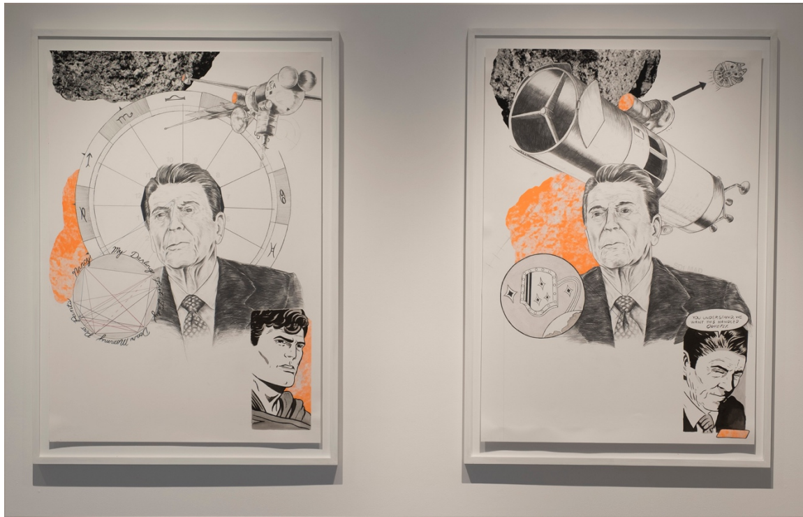
Figure 12: Michael Pennekamp, Chapter 4: Ronald Reagan or Written in the Stars , 28" x 40.5" (each), Graphite, Editing Pencil, Acrylic Paint, India Ink, Vinyl Letters, Silkscreen, Chine Collé on paper, 2017 (Image by Esther Nooner)