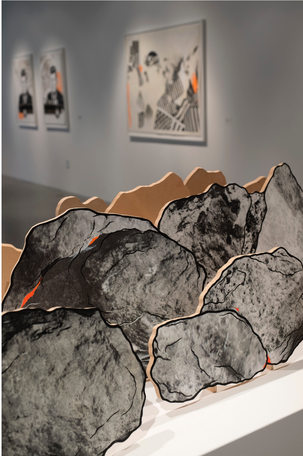
Figure 6: Michael Pennekamp, Lunar Samples (Aldrin) (Detail), Dimensions Variable, Silkscreen, Acrylic Paint, India Ink, Graphite, Phosphorescent Paint on MDF, 2017