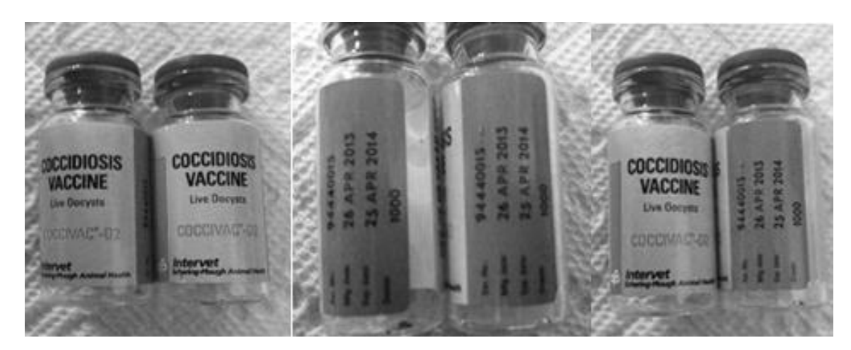
Image 1. Vials from Coccidiosis vaccine administered to chicks on University of Arkansas Poultry Science Farm at day of hatch and placed in 232 West.