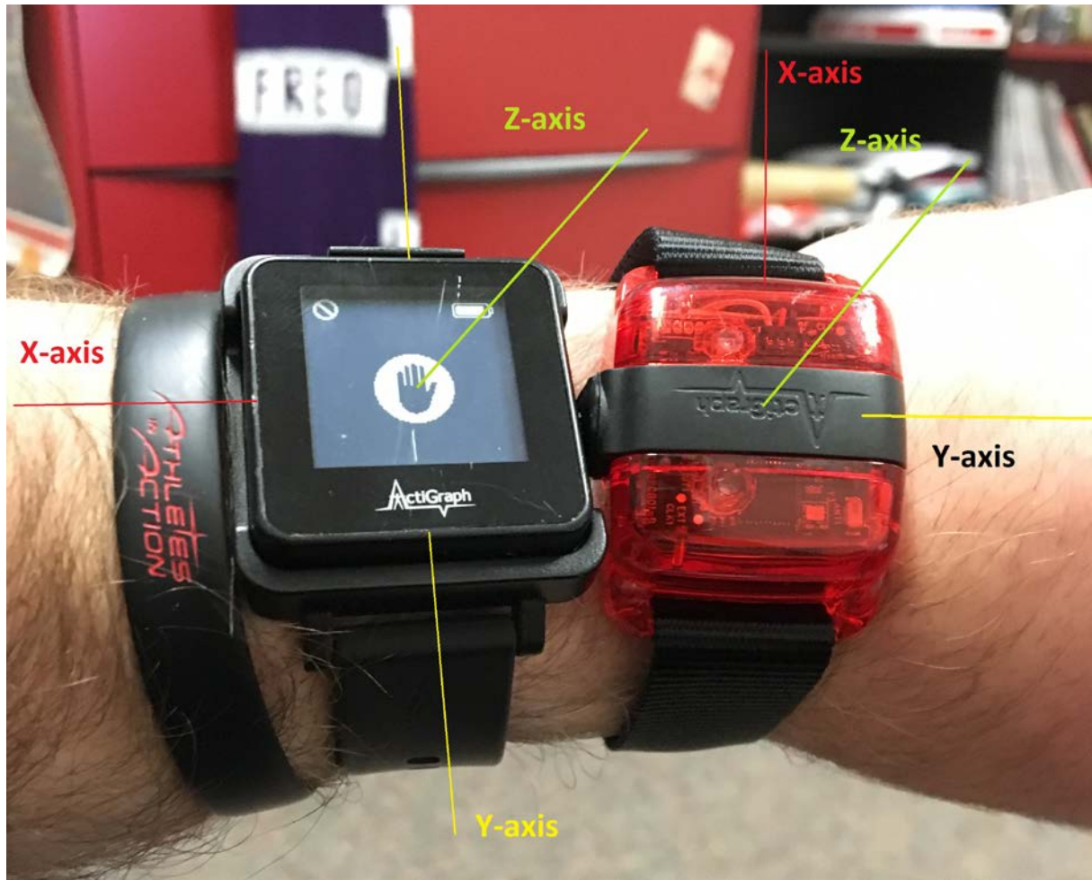
Figure 1. A picture of the Link (left) and GT3x-bt (right) and their axes on the wrist.