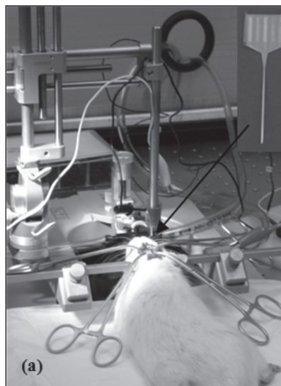
Figure 2. Experimental setup of the laboratory settings: Animal subject on the surgical work station with the neural probe (arrow) mounted on a stereotactic frame.

The tools and probes were sterilized with a diluted betadine solution to ensure that aseptic techniques were implemented. Prior to sterilization, all the equipment discussed in the experimental setup was checked for appropriate functioning.