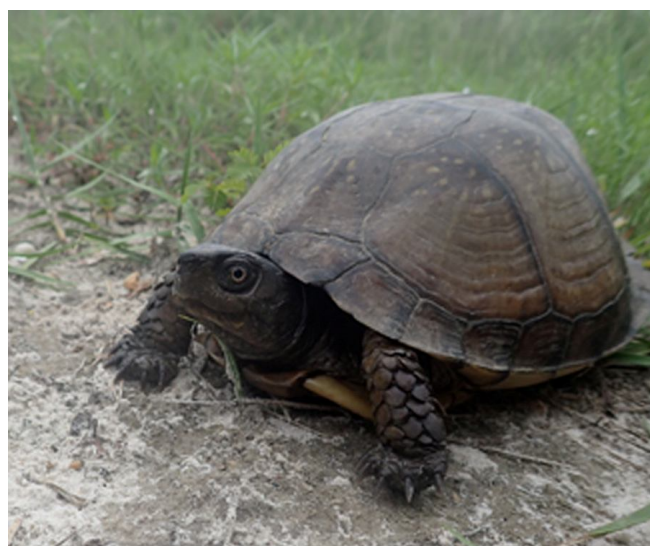
Figure 1. Gulf Coast box turtle, Terrapene carolina major .

Leeches collected were prepared as described by Moser et al. (2006). Specimens were subjected to molecular analysis according to Richardson et al. (2010) as follows: Purified PCR products were sequenced using the HCO2198 primer and the LCO1490 primer (Light and Siddall 1999) for the Cytochrome c oxidase subunit I products by the W.M. Keck Foundation Biotechnology Resource Laboratory at Yale University. Aligned DNA sequences were compared to other leech DNA sequences contained within Genbank and in the authors' databases to confirm identifications and deposited in GenBank. Specimens of leeches were deposited in the Peabody Museum of Natural History at Yale University, New Haven, Connecticut (YPM IZ).