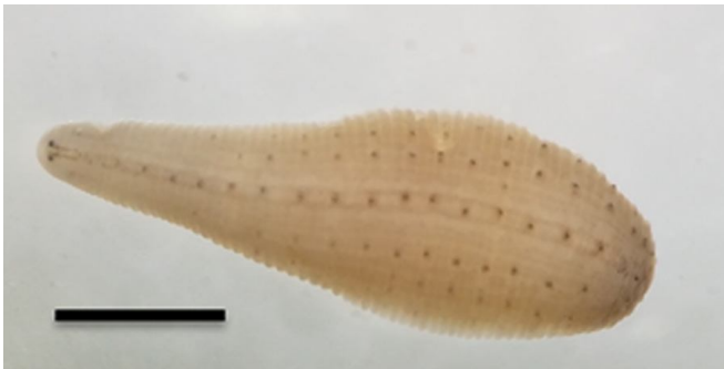
Figure 3. Helobdella europaea (YPM IZ 101859). Scale bar = 2 mm