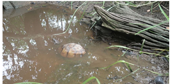
Figure 4. Gulf Coast box turtle, Terrapene carolina major , soaking in water.